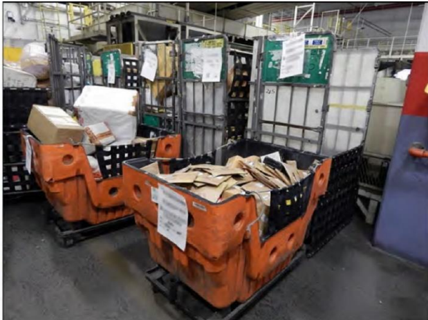
Figure 2/3: Inbound International Mail at the New York International Mail Facility<sup>9</sup>