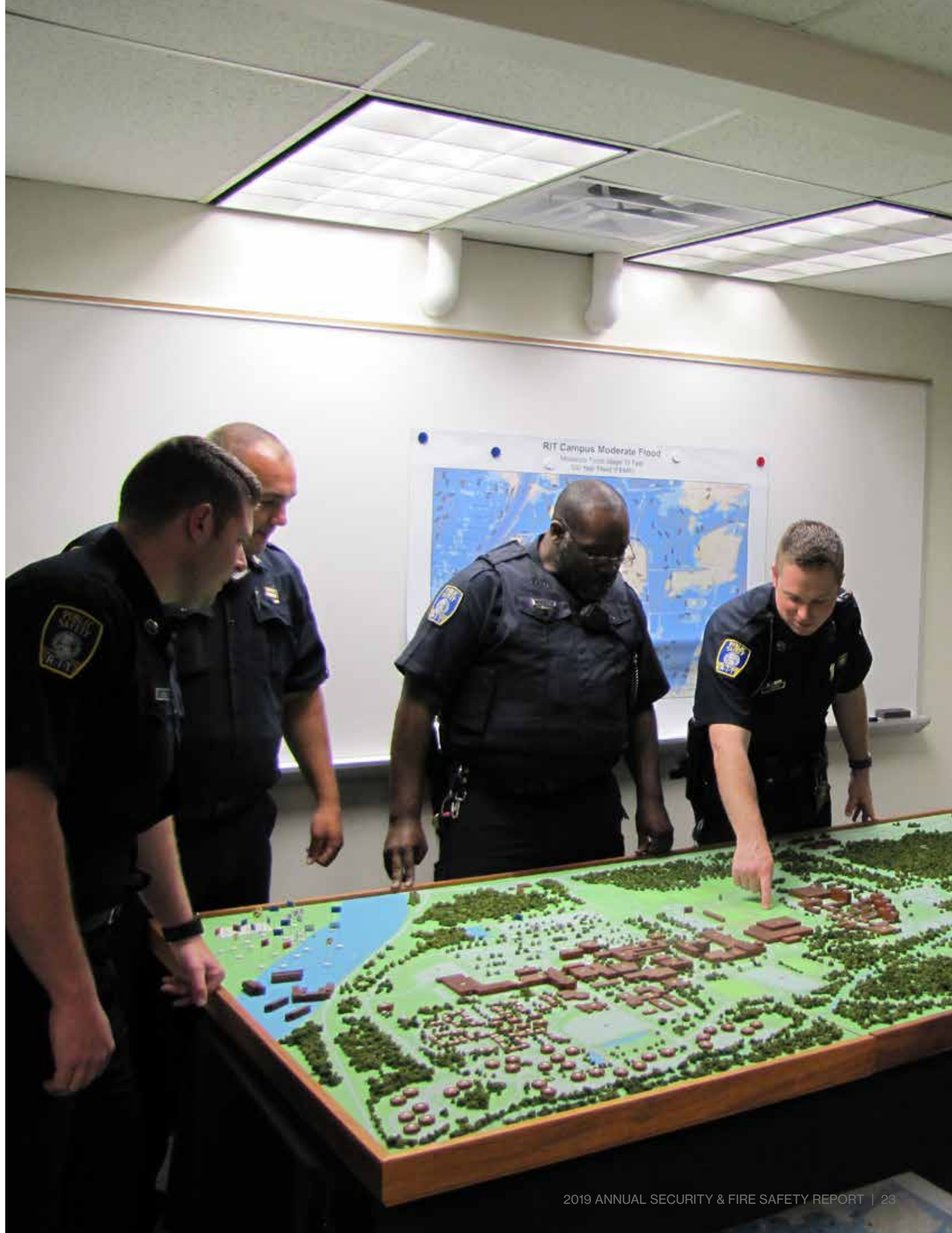
RIT Campus Moderate Flood

Maximum Flood Depth 10 Feet 100 Year Flood of 1981