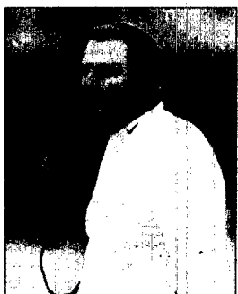
"They dominated and mauled us today."

Calhoun, who scored on two 4-yard runs, had 73 yards rushing and caught two passes for 58 yards. The two touchdowns marked the first multiple touchdown game for the sopho-