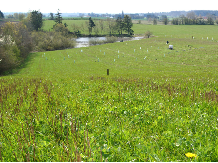
Establishment of the first permaculture settlement at Svanholm in 2016—view to the south.

Location: 50 km west of Copenhagen, Denmark.