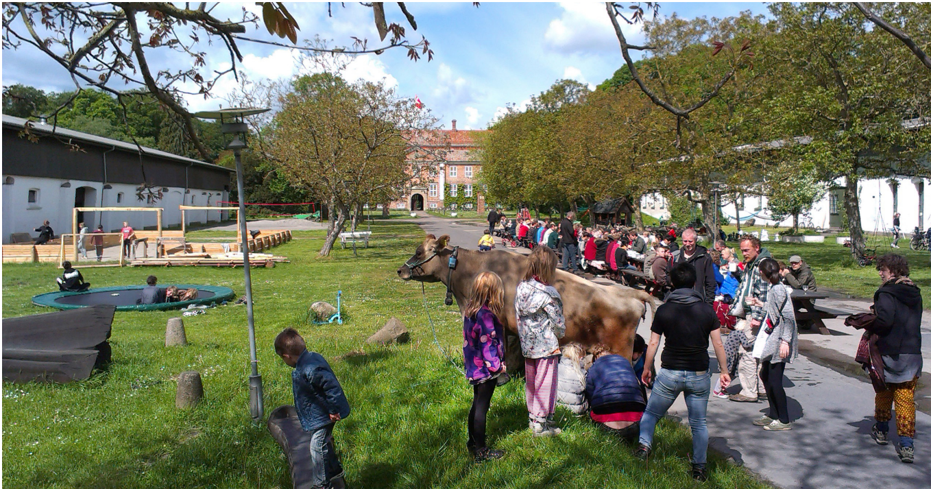
Every year on the 31st of May, Svanholm celebrates its birthday with a communal breakfast under the walnut trees.

and environmental sustainability to manage our use of resources so that we don't use more than we give. How to practise this principle, however, is more complicated than agreeing on it! Practising a sustainable lifestyle has required continuous adjustments in the almost 40 years since the founding of the community. However, external reports show that we have high biological diversity and only one third of the CO 2 emissions of an average Dane.