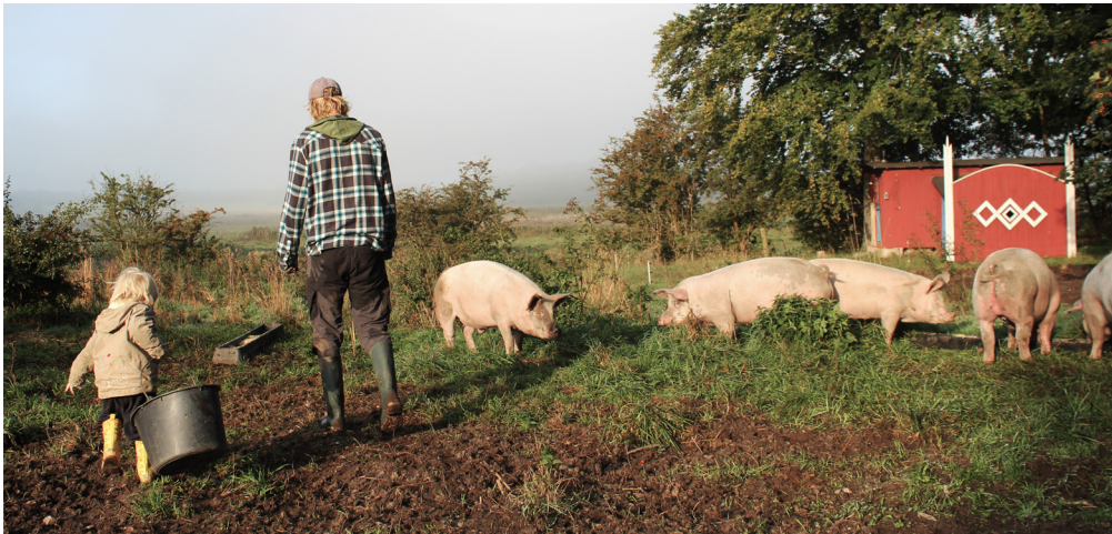
A dozen pigs satisfy Svanholm's appetite for pork, reduce the amount of kitchen waste and allow for harmonious family pictures.