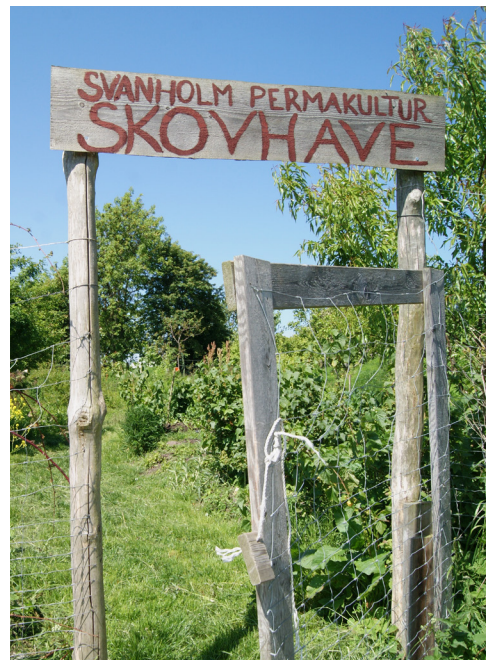
An existing forest garden used for teaching.

to volunteer at Svanholm and in the establishment of the permaculture settlement.