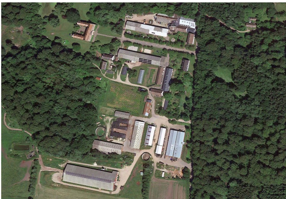
Aerial photo of the estate's buildings.