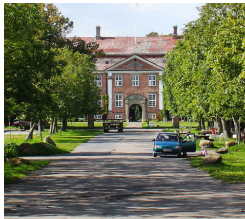
Above: The 800-year old estate main building.

Starting out with 150 people and only a few habitable rooms in the former estate owner's residence was a practical challenge. Much effort has been put into renovating buildings including establishing housing, common areas and other facilities to accommodate everybody. This development has turned the estate into a modern village providing amenities for individuals, community and visitors.