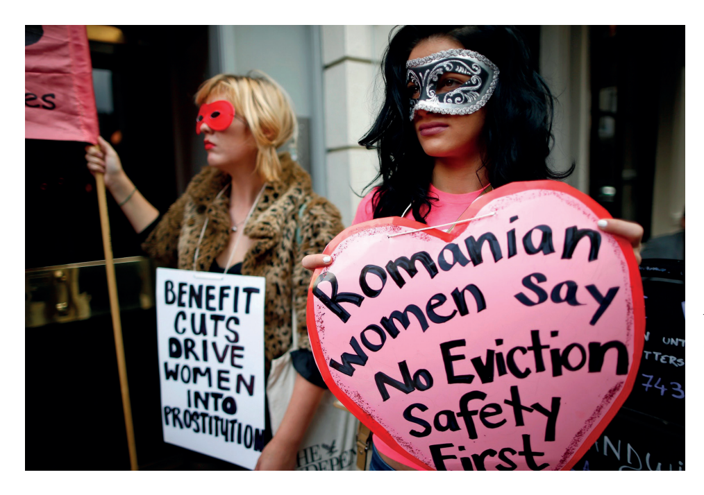
The English Collective of Prostitutes (ECP) protesting against police raids and evictions of migrant sex workers in Soho, London, UK, in 2013; Photo credit: ECP.

When pushed into illegality or to the margins of the legal labour market, migrant sex workers are forced underground into hazardous and unfavourable work conditions. This makes them particularly vulnerable to violence, harassment, and discrimination by clients, the general public and law enforcement agencies. Their undocumented status also renders them prone to abuse in work settings and severe exploitation, as it increases migrant sex workers' dependency on third parties and different