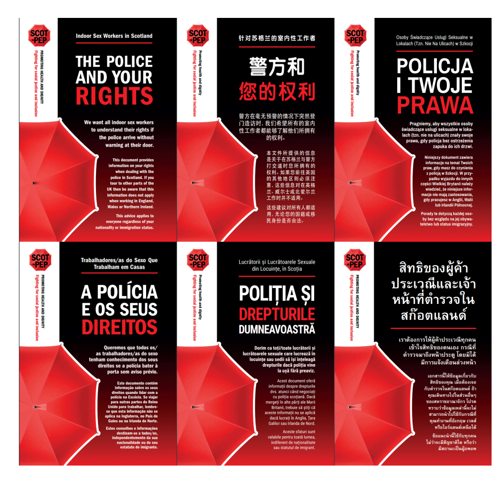
'Know Your Rights' cards for indoor sex workers in Scotland in Chinese, English, Polish, Portuguese, Romanian and Thai developed the Scottish Prostitutes Education Project (SCOT-PEP).

gender equality. The strengthening of the anti-trafficking framework can also be associated with the growing attention to increasing international migration, the role of organised crime in the clandestine movement of people across borders, and in the wake of panics about massive-scale immigration.