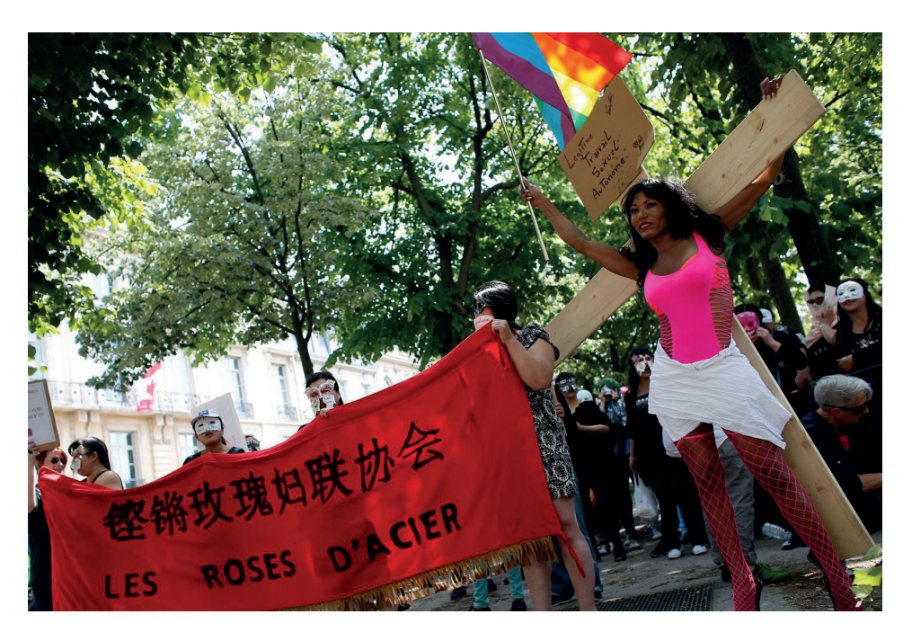
Members of Chinese sex worker collective in France, Les Roses D'Acier (Steel Roses), participating in a demonstration against criminalisation of sex workers' clients in France, Paris, 2015; Photo credit: afp.com/Thomas Samson

significantly limited and hinges on conditions. In Germany, Ireland and the UK, for instance, those healthcare services are only available to undocumented migrants against payment. In France and Spain they are available free of charge to those migrants who can provide a proof of identity and fixed address (or a so-called 'habitual residence').<sup>56</sup>