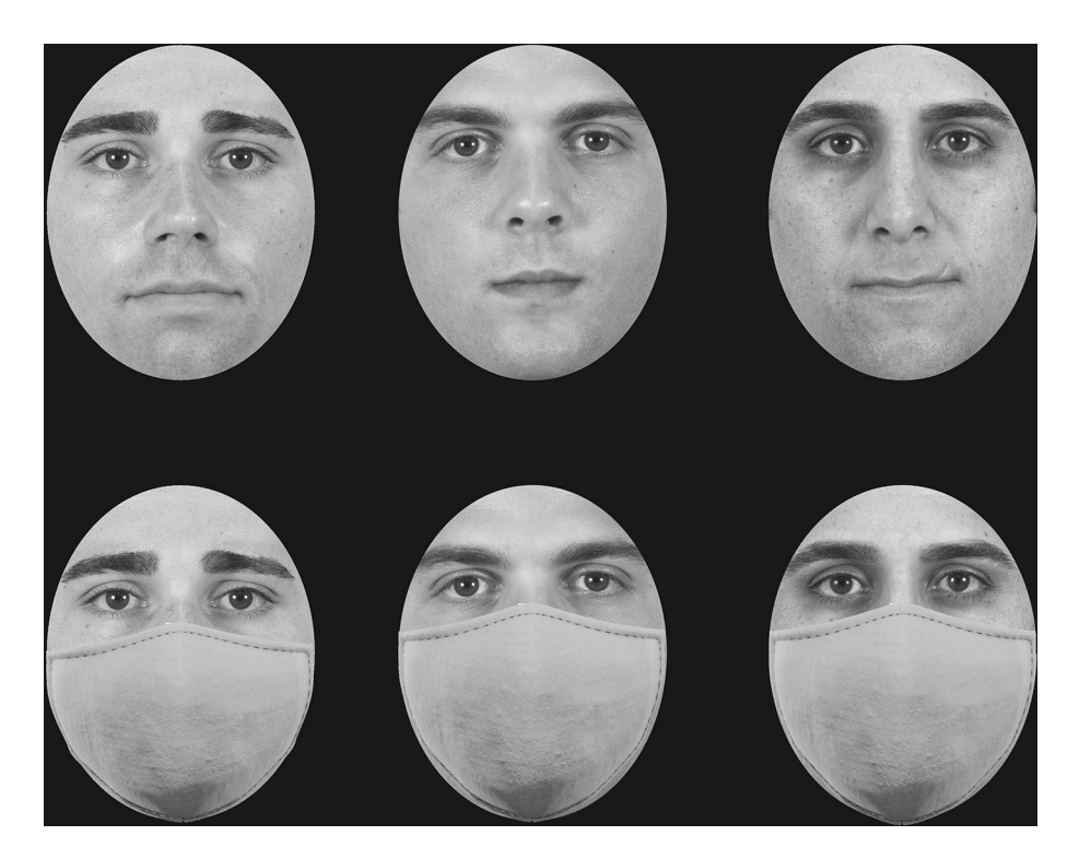
Figure 1. Examples of faces with and without masks similar to the ones used in the experiment. Faces are reproduced with premission from the Chicago Face Database<sup>44</sup>.