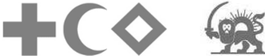
Red Cross Red Crescent Red Crystal Red Lion and Sun (withdrawn)

7.15.1.1 Red Cross. “As a compliment to Switzerland,” the heraldic emblem of the red cross on a white ground formed by reversing the Federal colors is retained as the emblem and distinctive sign of the Medical Services of armed forces. 387 The explanation that the red cross is used as a compliment to Switzerland was added to emphasize that the red cross is not intended to have religious significance. 388 The red cross has long been used to identify medical personnel during armed conflict. 389