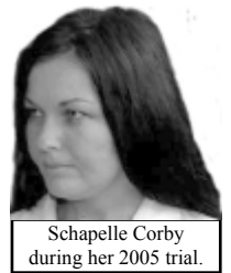
Schappelle Corby during her 2005 trial.

Australian Schappelle Corby's story of being sentenced to 20 years imprisonment in Indonesia on a false drug smuggling charge was featured in JD Issue 32, Spring 2006, "Schappelle Corby's Bali Vacation Turned In- to 20 Year Prison Sentence By Planted Drugs."