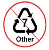
Can contain Bisphenol A Polycarbonate