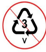
PVC or vinyl Can contain phthalates