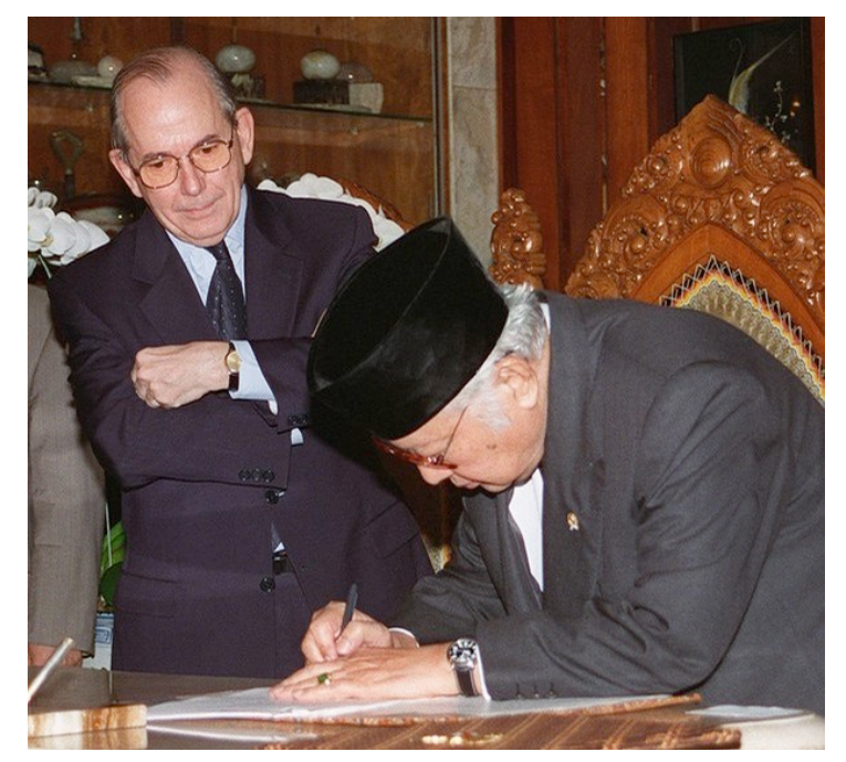
Figure 2. Suharto signing the January 1998 reform agreement under the watchful eye of IMF Director Michel Camdessus.

decades, the vast opportunities to dispense patronage to friends and potential foes alike had reinforced Suharto's centrality in all aspects of Indonesian political and economic life. It was this very network of patronage that the IMF, and by extension the United States, sought to destroy, though by doing so while Suharto's increasingly desperate regime controlled the reins of power removed any incentive for cooperation amongst the many beneficiaries of the existing New Order. The necessity of decentralizing economic control and long-standing policy differences between economic technocrats and nationalists raised the stakes, and difficulty, of reform. In this sense, the necessity of economic reform was invariably linked to far-reaching political reform, to which Suharto