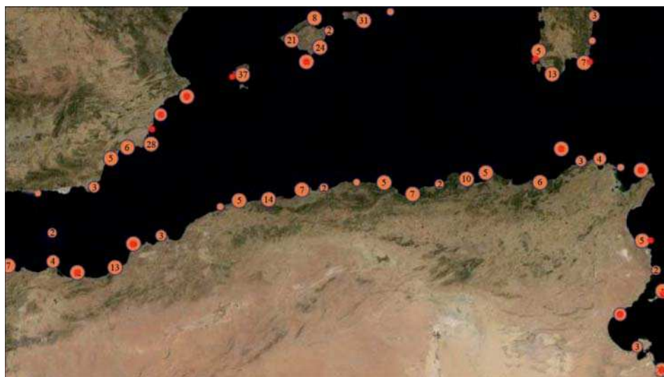
Figure 1. Screenshot centered on Algerian and Tunisian coasts after the PIM database ( www.initiative-pim.org ). Main archipelagos are circles spotted in red. Number of islets aggregates included within others circles are written in the circle.

Mediterranean belong to regional biodiversity hot-spots like Betico-Rifean and Kabylies-Numidia-Kroumiria complexes (Médail & Quézel, 1997; Véla & Benhouhou, 2007). Their biogeographical position, often near the putative mean glacial refugia areas (Médail & Diadéma, 2009), made them probably good biodiversity refuges during glacial ages, even more because their area was considerably increased by a lower sea level. Today yet they appear as site favourable for micro-speciation (Greuter, 1995) and refuges for some rare species and/or vulnerable biota.