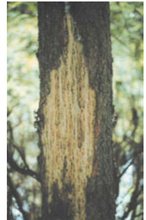
Figure 4. Bear sign on log and tree trunk.