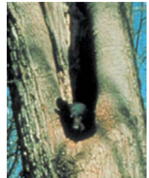
Figure 1. The American black bear in a tree and in its den at the White River National Wildlife Refuge.

destruction. In the early 1900s, much of Arkansas’ forestlands were logged and cleared for farmland. By the 1930s, less than 50 black bears were thought to remain in the state, with most residing in what is now the White River National Wildlife Refuge in southeastern Arkansas.