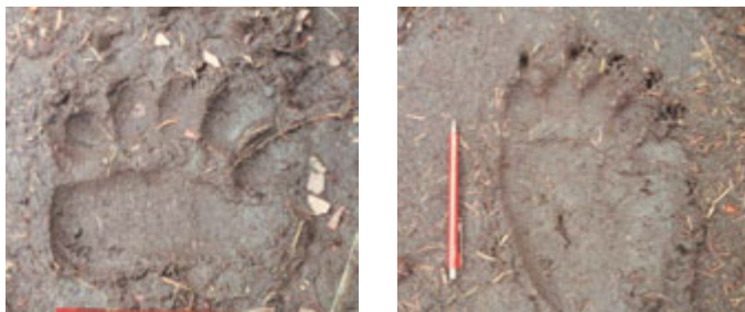
Figure 3. Bear paw prints. Forepaw (left), hindpaw (right).

Without actually seeing bears, you can determine if bears have been in a particular area by the sign they leave behind. Paw prints in mud or sand are relatively easy to identify. The toe pads on the forepaw of a black bear form an arch over the much larger footpad (Figure 3). The hindpaw print, which can be as much as 9 inches long, resembles a human footprint.