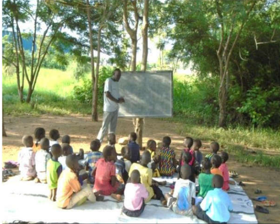
Grade 3 meeting under a tree

is prompted to respond to the dire need of the displaced children in Juba. SRC had planned to start three primary schools in 2017 in Juba. But due to resource limitation she has started one primary school early this year with 179 pupils. Once these schools are operational, SRC hopes to start other four schools in Bentiu, Malakal, Awiel and Langken. The objective of the plan is to provide and increase access to education for the children affected by the conflict. SRC has lands and spaces for erection of temporal learning spaces and has also identified and selected 18 volunteer teachers and three supervisors from the congregations. There are some SRC partners who have pledged to stand beside SRC and help in the realization of these schools.