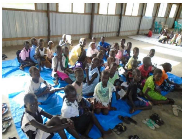
Grade 1-2 meeting at Bethel church building

Based on update UNICEF data, there are 2 million children out of schools in South Sudan due to conflict and displacement. SRC in spite of her own struggles in this difficult situation