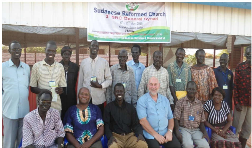
3 rd SRC General Synod delegates in Malakal

Sudanese Reformed Churches (SRC) started in Khartoum, Sudan in 1992. In God's grace SRC has grown into (16) churches all over South Sudan and Sudan with (12) ordained pastors and (17) evangelists. On February, 2005, the four house fellowships in Khartoum were organized as Christian denomination under the name "SUDANESE REFORMED CHURCHES". Further on 31 st October, 2005, a committee was formed to provide leadership. Belgic Confessions, Heidelberg Catechism Canons of Dorts and Reformed Church Order were adopted as the confessional, doctrinal and structural basis of the denomination. The 1 st Synod of SRC was held in Khartoum on 17 th – 18 th April, 2009 while the 2 nd SRC General Synod was held in Juba 27 th April to 5 th May, 2011. In SRC strategic Plan (2011-2015), it is hoped to plant 36 more churches: 25 in South Sudan and 11 in Sudan.