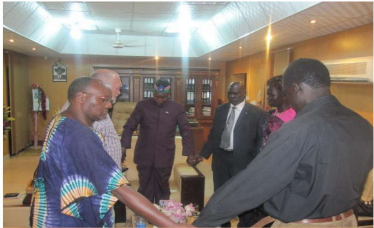
Praying with the Deputy Governor (center) in his office

The SRC Leadership together with the international delegates paid a visit to speaker of state assembly and to Upper Nile State Deputy Governor. While he was sharing his challenges in his office, he became so emotional and shed tears. He was exhorted and encouraged. In turn he greatly appreciated the visit and described it as timely. We prayed together to the Maker of heaven and earth to give insight and wisdom to the leaders of the new nation, South Sudan.