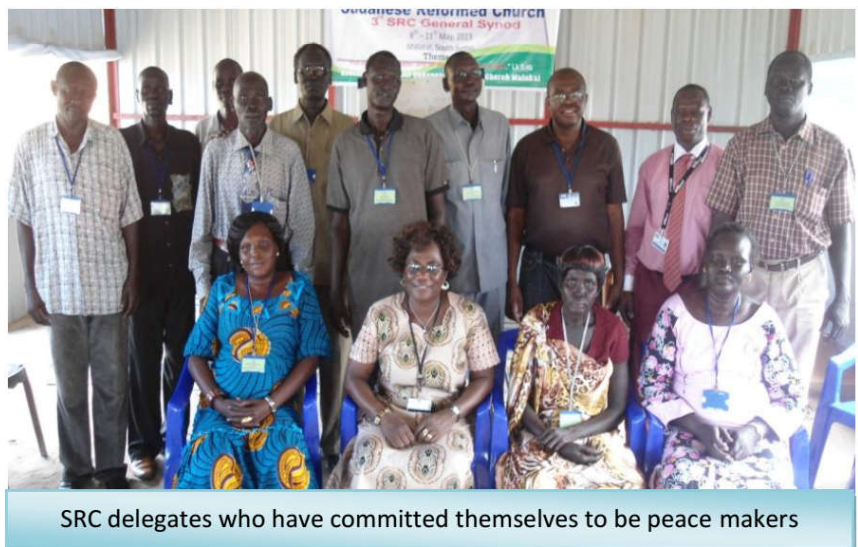
SRC delegates who have committed themselves to be peace makers

South Sudan had been in war for 55 years. The notable features of people daily life are war trauma, violence, tribal tension, mistrust, and cattle raiding just to mention a few. Thus the leadership has envisioned that SRC should play her role in bringing reconciliation, healing and