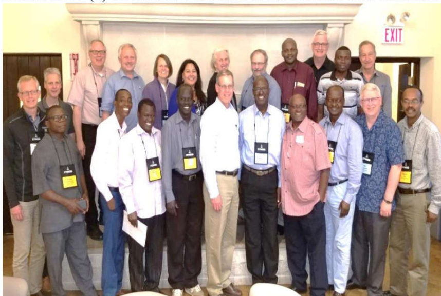
Eastern and southern Africa guests with CRCNA agencies heads

Christian Reformed Church of North America (CRCNA) held her Synod 2017 at Trinity Christian College in Palos Heights, Illinois as from 9-15 June, 2017. For the first time, CRCNA invited nine (9) Reformed Churches from Eastern and Southern Africa as ecumenical guests.