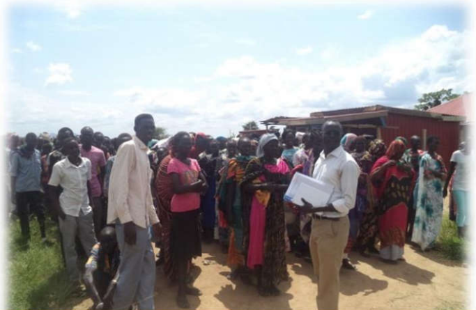
Needy IDPs waiting to receive relief food items

South Sudan was plunged into brutal civil war in Mid-December 2013 when President Salva Kiir and his former deputy Riak Machar ran into political disagreements just two years after its independence from Sudan. This resulted in eruption of horrible and tribal civil war in which tens of thousands were killed and half of the population of the new nation displaced from their homes. Even after a peace agreement was brokered in August, 2015 there were sporadic outbreaks of fighting. Last July, the rival forces to the agreement clashed militarily in Juba resulting in loss of hundreds of lives and tens of thousands of Juba residents fleeing to the neighboring Uganda and DRC. This has placed the peace agreement into dilemma and inevitable return to full scale of civil war.