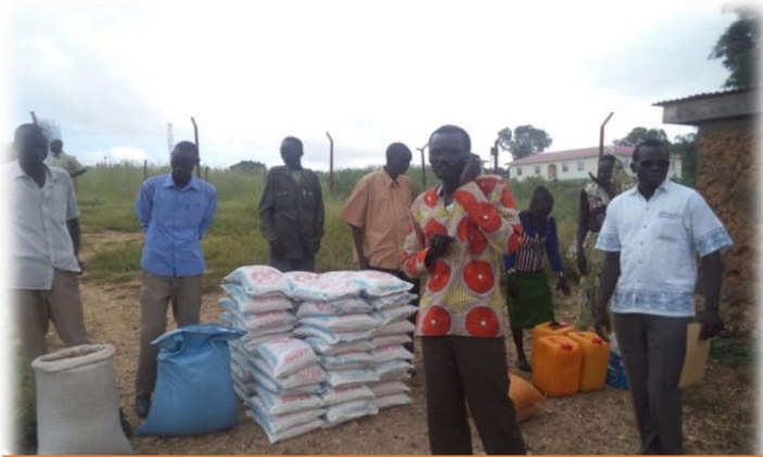
Needy IDPs receiving relief items at Khor Woliang