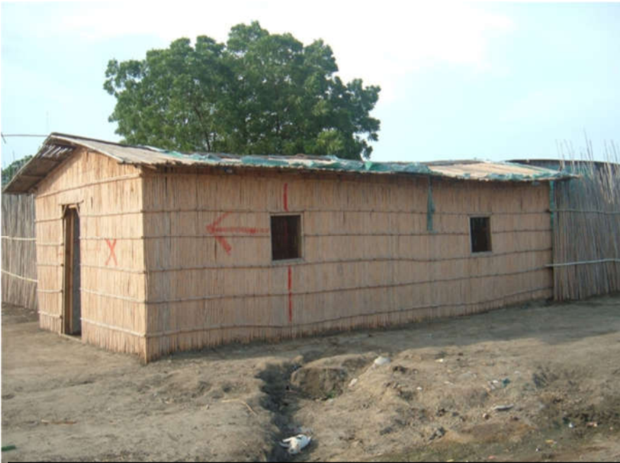
Figure 5. 1 st SRC church planted in Malakal, 2008