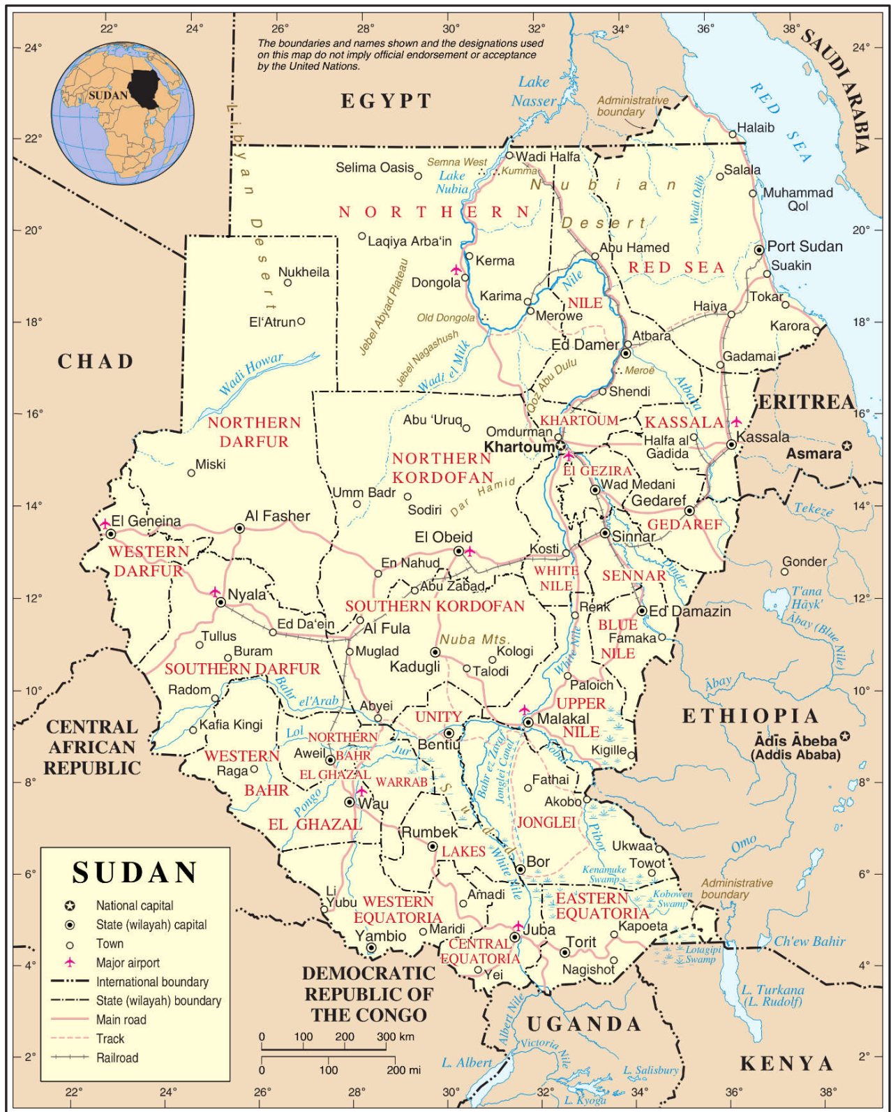
FIGURE 1: Map Sudan