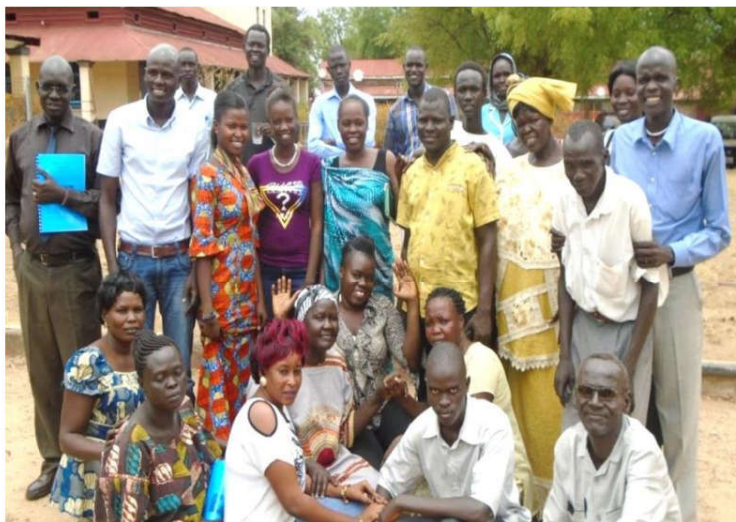
Some SRC participants at trauma healing training

SRC in partnership with WORLD RENEW, South Sudan has in January and April, 2017 organized two trainings on trauma healing. The trainings were fully funded by WORLD RENEW, South Sudan. It was attended by 52 participants from four different Christian denominations in Juba (South Sudan Presbyterian Evangelical Church, Christian Brotherhood Church, Sudanese Church of Christ and Sudanese Reformed Church).