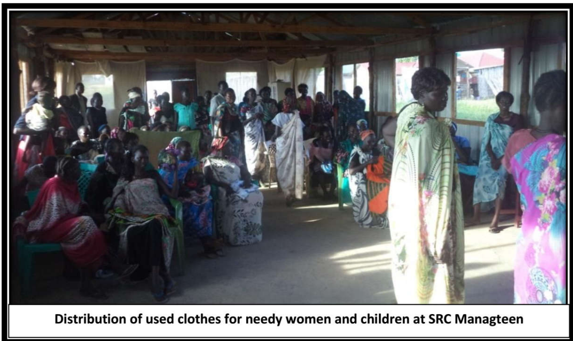
Distribution of used clothes for needy women and children at SRC Mangateen

The relief was distributed to 946 households who live in Mangateen, Jebel, UNMISS Thongbiny and Khor Woliang. Relief money was also sent to SRC needy IDPs in Malakal, Bentiu and Bor since there were no way to send relief items to those areas due to absence of transport accessibility. It was a demonstration of Christ's compassion at tough time when it seemed nobody was ready to show mercy.