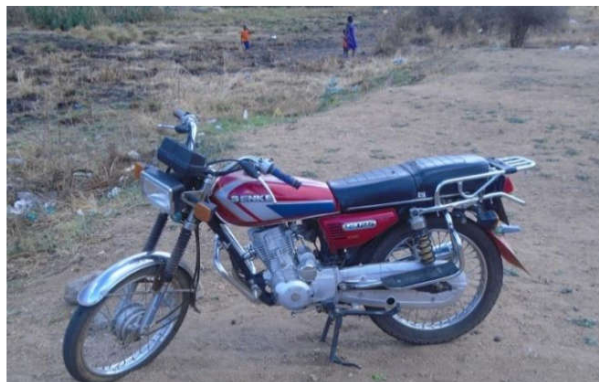
Bought used motorbike for evangelism activities

conflict in Juba again has lost her only remaining mission/evangelism vehicle. This has made her mission/evangelism activities in Juba very difficult. With contribution from SRC members, SRC has bought a second hand motorcycle. Relatively, this motorbike has eased the mission/evangelism activities in Juba. We are praying to the Lord for vehicle provision.