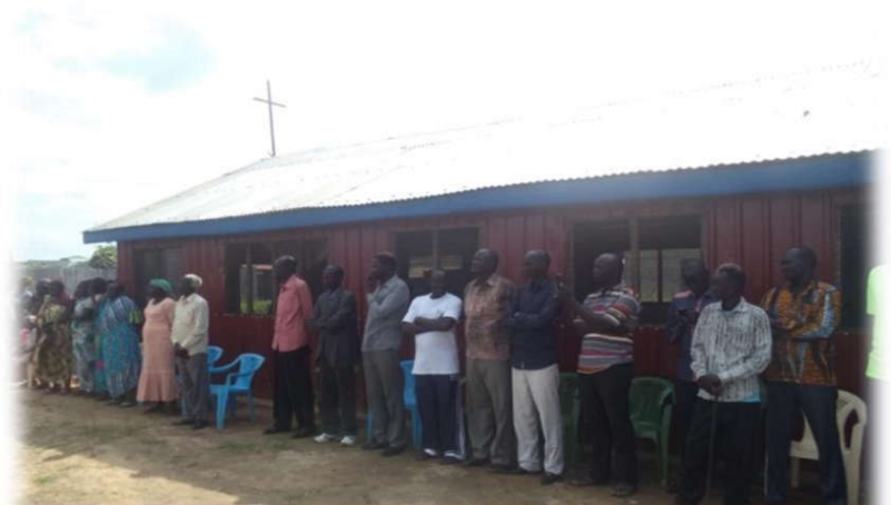
Some SRC members at Mangateen queuing to receive relief items

The general situation of SRC is both discouraging and hopeful. Why? SRC is laboring in areas with widespread military conflict, social upheaval and religious intolerance. Many areas are still too troubles and insecure to start planting new churches. Practically, SRC possess no adequate buildings, office equipment and even vehicle to facilitate her mission and daily activities. Because of the war many members are trapped in relative poverty, displacement and famine. The ministry has no sufficient resources and capacity to cope with physical need of the congregational members and communities around them. The pastors and evangelists that are laboring in their midst have no salaries or financial rewards. Lack of financial resources is sometimes source of disagreement to some