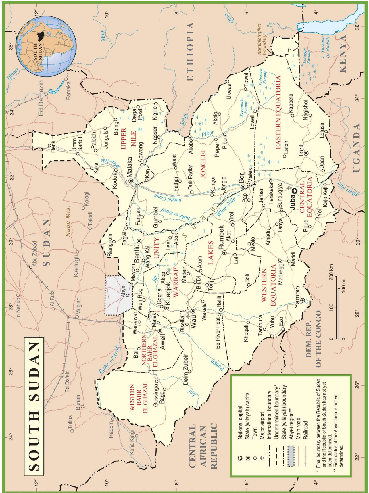
FIGURE 2: Map South Sudan