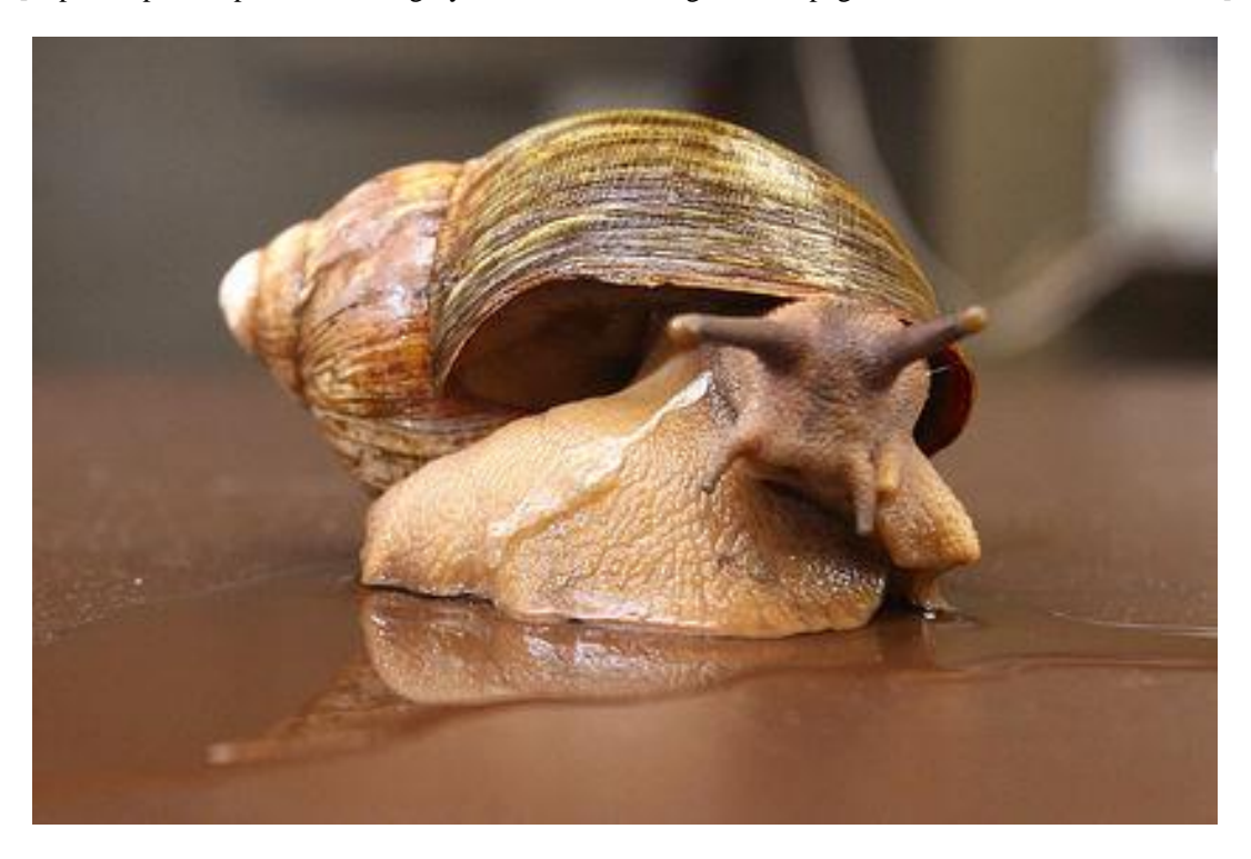
Fig. 5. Slime produced by Achatina fulica .

[http://www.torontosun.com/2014/07/14/giant-african-snails-seized-at-los-angeles-airport downloaded 8 March 2016]