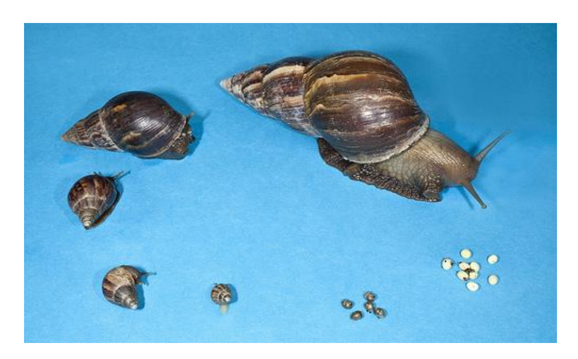
Fig. 4. Morphology of growth in the giant African snail from egg to adult. [https://fldpi.wordpress.com/category/homeowners-and-gardeners/page/3/ downloaded March 8 2016]