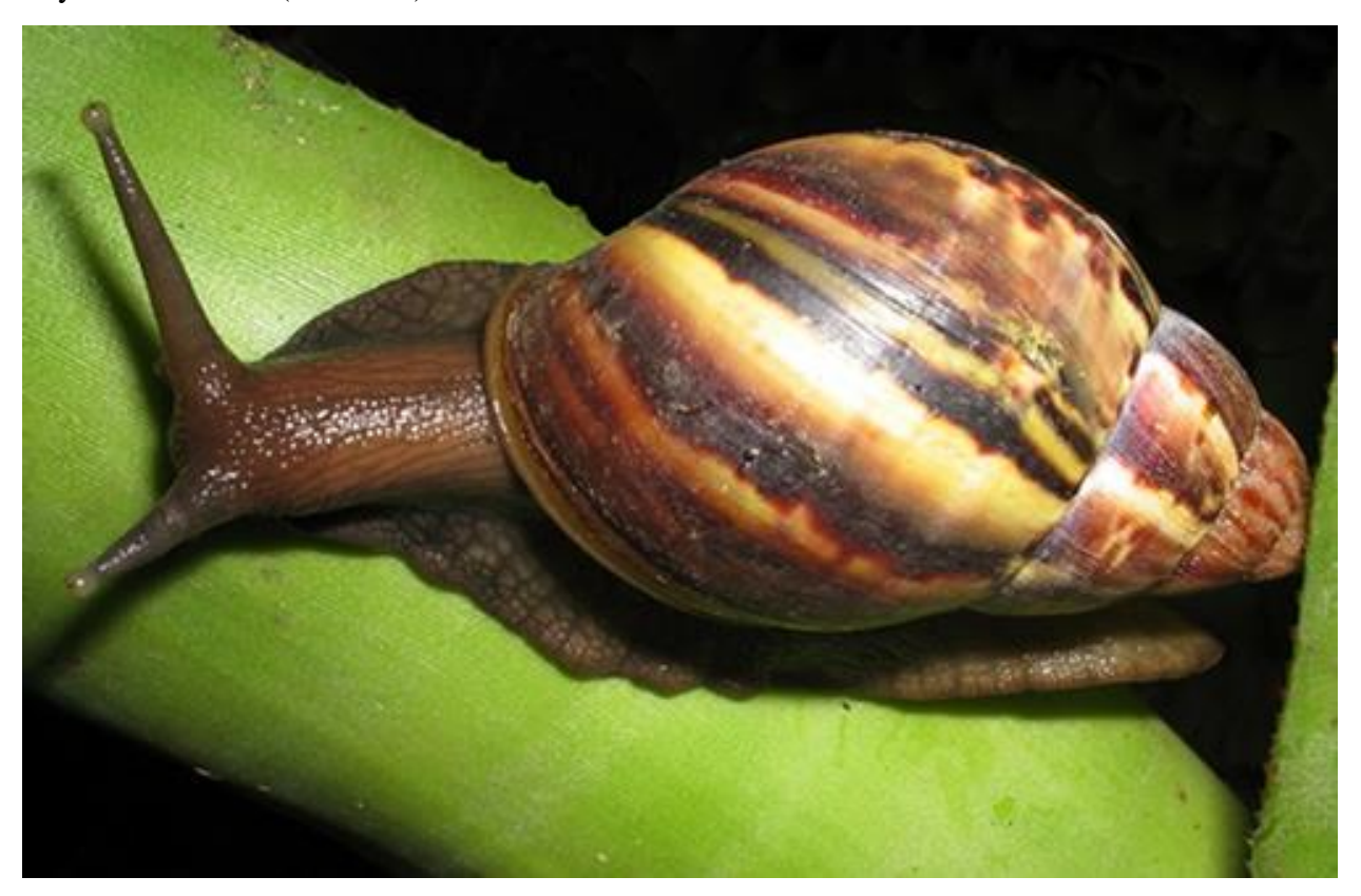
Fig. 1. Giant African snail, Achatina fulica .

[http://www.infobibos.com/Artigos/2009_1/Caracois/3.jpg, downloaded 29 February 2016]