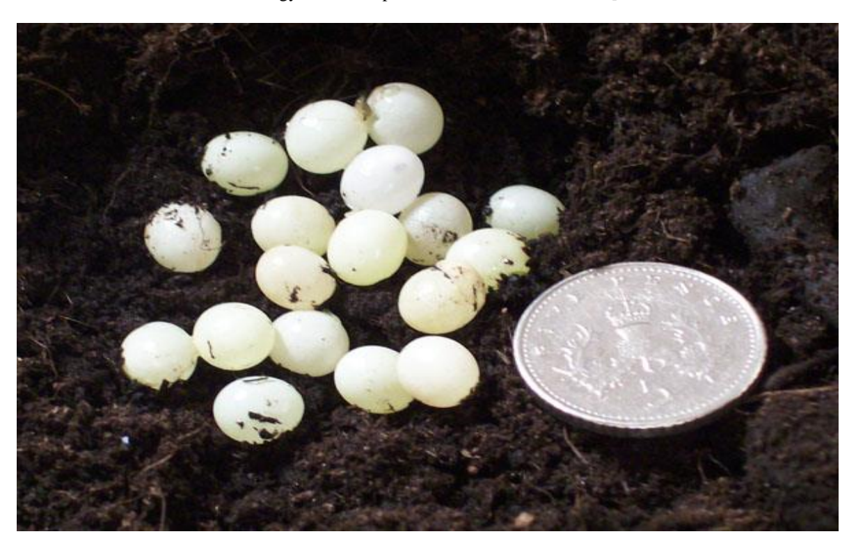
Fig. 3. Size of the eggs from Achatina fulica snail.

[http://freshfromflorida.s3.amazonaws.com/The-Giant-African-Snail-Lissachatina-fulica-History-and-Reported-Biology_Robinson.pdf downloaded 4 March 2016]