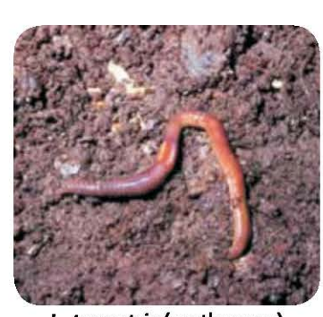
L. terrestris (earthworm)

We are going to examine biotic and abiotic elements in an aquatic ecosystem.