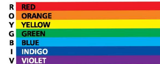
colors of the rainbow

TIP To help students remember the colors of the rainbow, the Rainbow Man's name is ROY G. BIV = Red, Orange, Yellow, Green, Blue, Indigo, Violet.