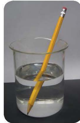
broken pencil effect in water