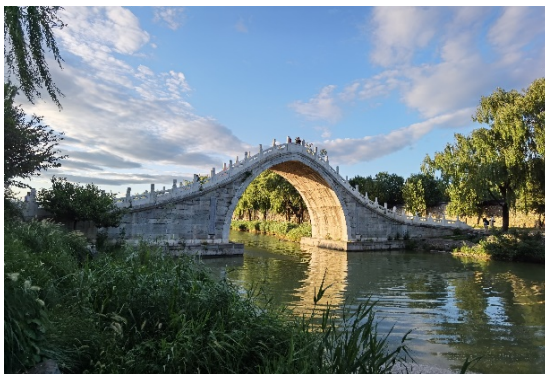
Beautiful-Ripples Bridge (Xiuyi Bridge)

I walk around the lake to find peace in the looming darkness, and exit the Garden from the east entrance to meet the high wooden arch of delicate colors and paintings with the name stone in the lights.