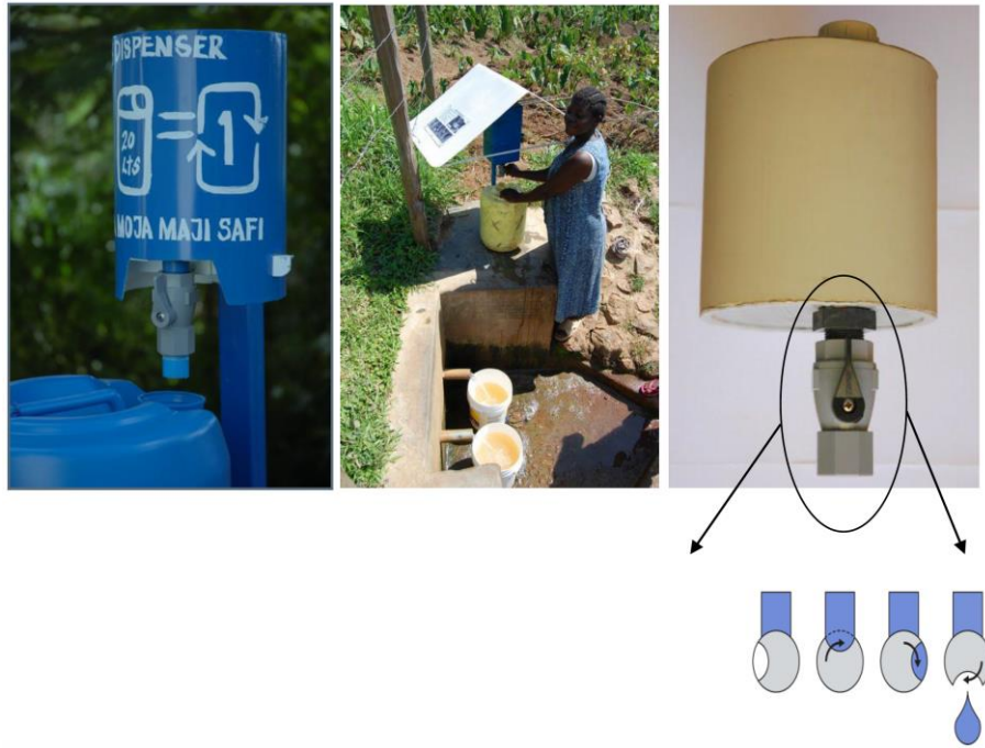
Figure 1: The Chlorine Dispenser