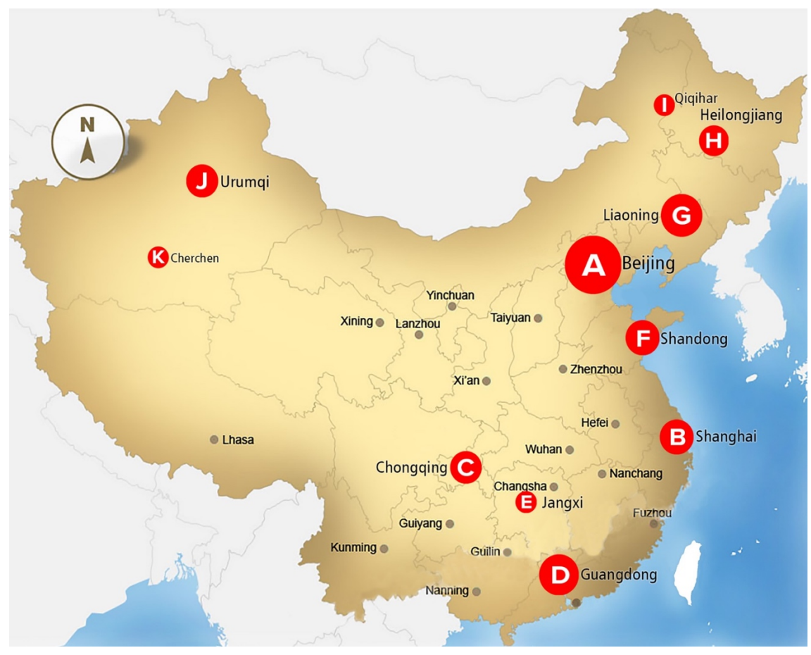
Detention Cluster Map