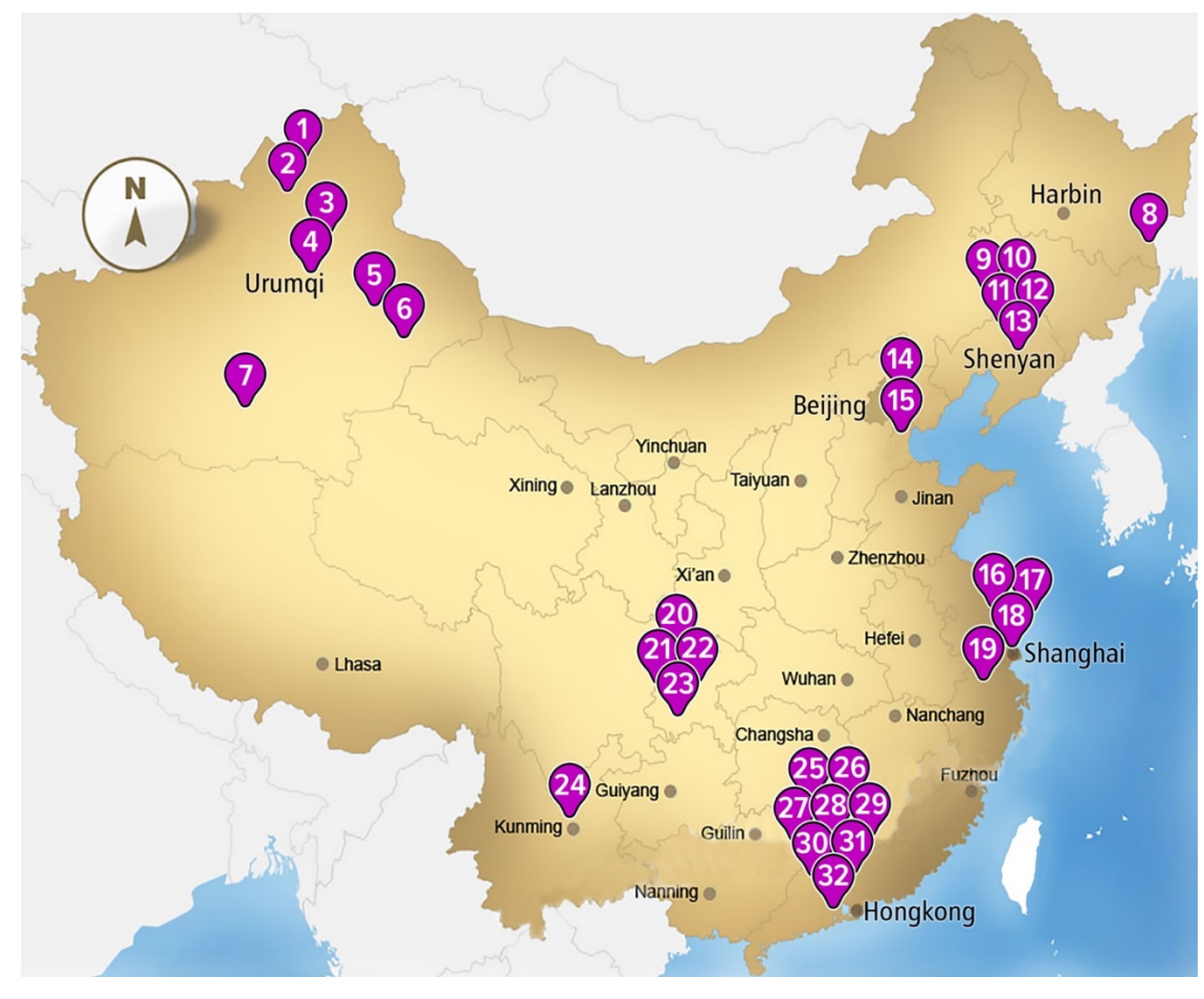
Hospital Pointer Map