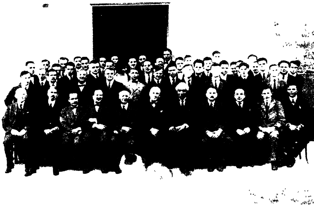
Figure 2. Group at Norman Bridge Laboratory of Physics, Pasadena, California. C V Raman with his host Robert A Millikan (right to Raman). In 1924, Raman was invited as Visiting Professor.

The first Volume of the Journal also contains one of Raman's rare photographs with the American Nobel Laureate Robert Millikan (see Figure 2).