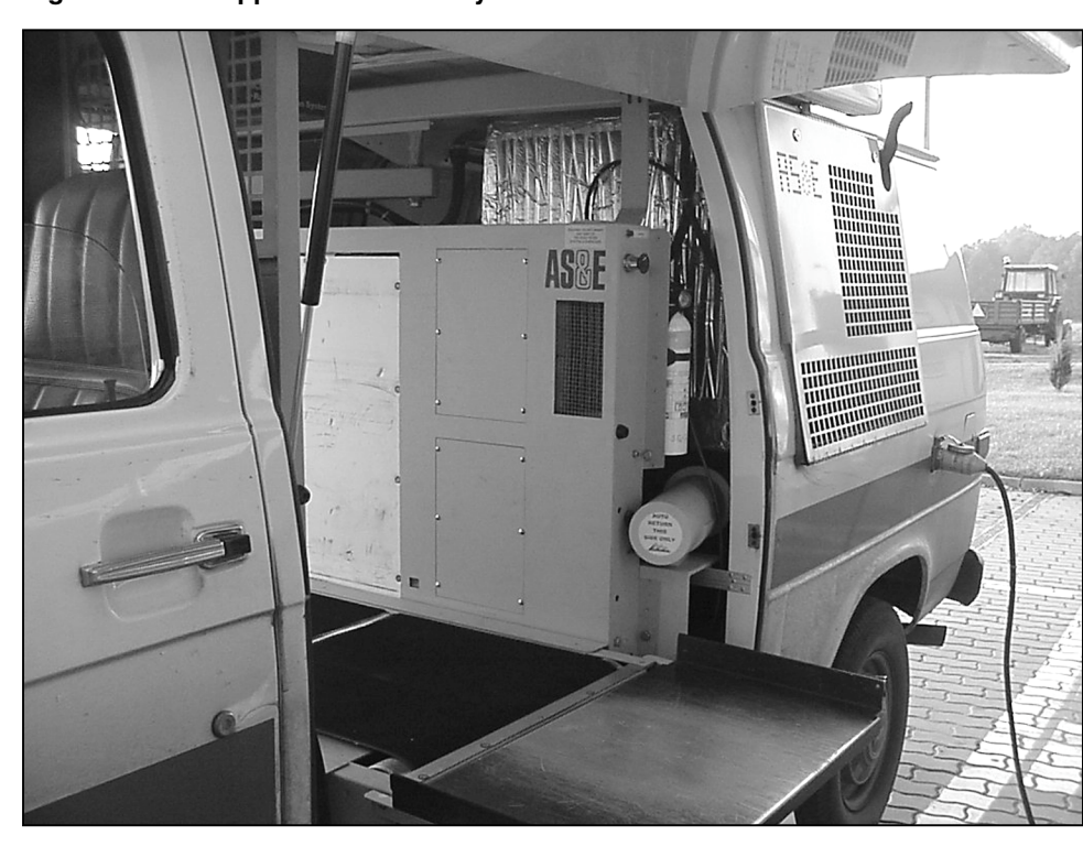
Figure 3: U.S.-Supplied Mobile X-Ray Van

Russian customs officials told us that radiation detection equipment funded by DOE's Second Line of Defense program has helped accelerate Russia's plans to improve border security. According to these officials, as of October 2001, DOE had financed the purchase of about 15 percent of Russia's 300 portal monitors. The U.S.-funded equipment is manufactured in Russia and is subject to site acceptance testing conducted by DOE national laboratory personnel. This testing is designed to ensure that portal monitors are placed in an optimal configuration (to maximize detection capability) and that the equipment is being used as intended. According to Russian officials, there is excellent cooperation with DOE on ways to continually improve the performance of the equipment. Russian customs officials also told us that DOE has done a very credible job of making follow-up visits to inspect the equipment and ensure that it is recalibrated as necessary to meet performance specifications.