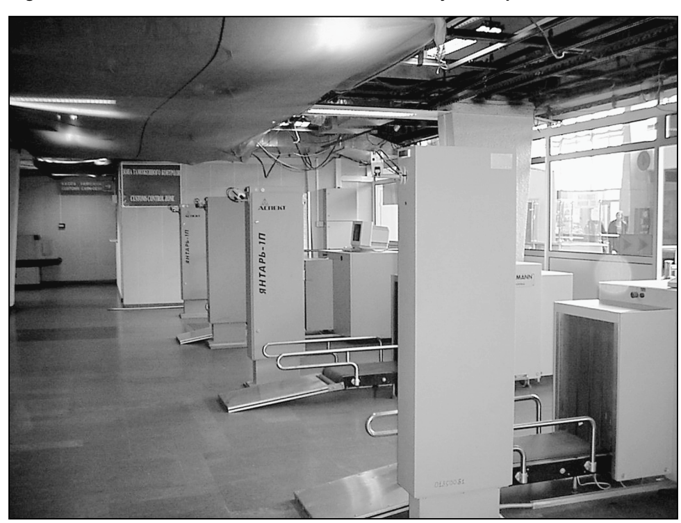
Figure 4: U.S.-Funded Portal Monitors at the Sheremetyevo Airport in Moscow

computerized monitoring system, also funded by DOE, that was connected to the portal monitors. DOE's detection equipment installed throughout Russia is monitored by closed circuit cameras. Russian officials tested the equipment we saw at the airport on our behalf. They "planted"—with our knowledge—a radioactive source in an attaché case that we carried past a pedestrian portal monitor, which activated an alarm. A computer screen in the control room displayed our movements past the portal monitor.