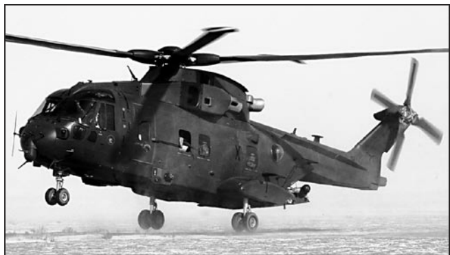
Figure 1. EH-101 Special Operations Version. The Agusta Westland EH-101 is being considered by a number of nations as their future special operations helicopters due to its large capacity (30 combat troops or 5 tons), long range

(750 nautical miles), aft ramp, advanced avionics, and aerial refueling capability.