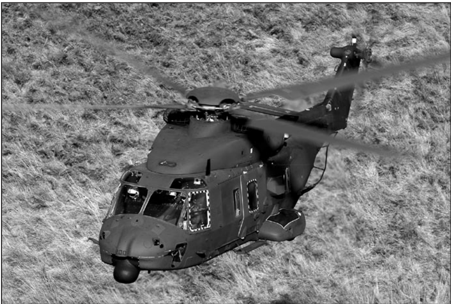
Figure 5. Agusta Westland NH-90 Special Operations Version. The NH-90 gives nations the ability to lift 20 combat loaded troops. It is being produced in a special operations version.

Fielding a diverse force will require NATO standards for interoperability and employment, yet it also offers great opportunities. It becomes the task of the special operations planners, airmen, and commanders to effectively employ the range of capabilities found among the special operations aviation task groups contributed by the nations to an operation.