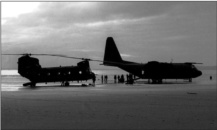
Figure 3. Special Operations C-130 and Chinook. C-130 transloads fuel and personnel to a Chinook at an austere landing zone.

The flying part of special operations aviation is the most difficult to achieve because of resources, manpower, and fiscal considerations. MC 437/1 requires that a national special operations task group possess the ability to infiltrate and exfiltrate using air [emphasis added], land, and sea means into and out of the opera-