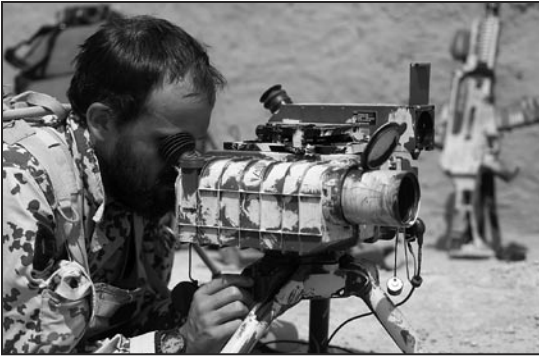
Figure 4. Battlefield Airmen in Action. Special operations terminal attack controller marking a target for a strike by conventional air power. (Used by permission.)

operators from most of the member nations and all the different armed services in the past 4 years indicates that they want and need published NATO standards, whether in AJPs or in NATO Standardization Agreements (STANAGs) to guide the member nations' leadership as they develop and equip air and aviation forces for special operations.