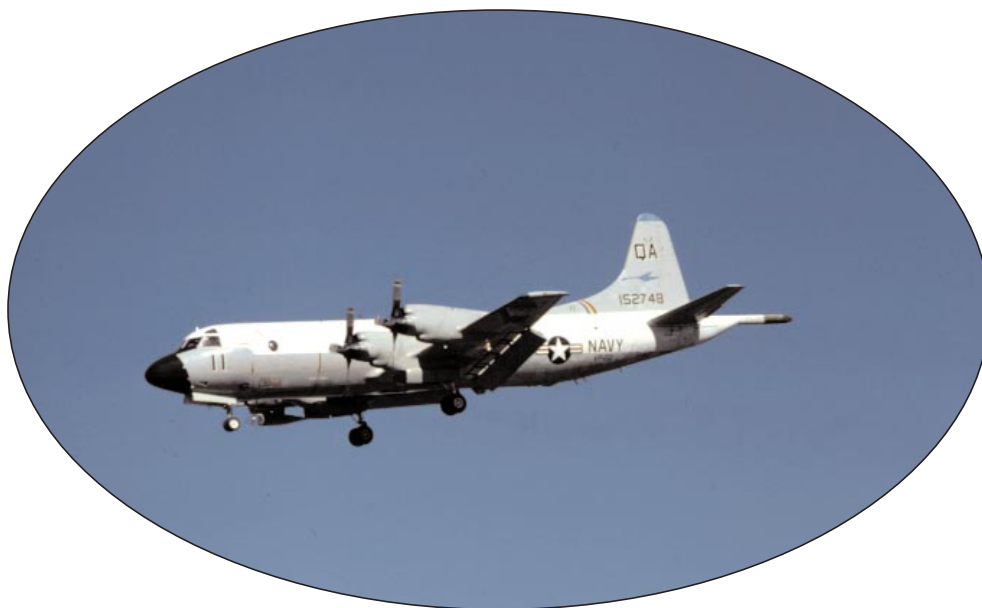
A VP-22 P-3B preparing to land at NAS Moffett Field in August 1978.