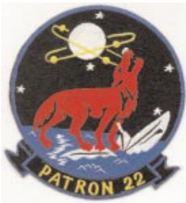
The squadron's third insignia used a howling wolf as its center piece.

proved by CNO on 13 March 1961. This time the goose was more aggressive, clawing at a submarine which was breaking in two, with wings thrust upwards. In a scroll at the bottom of the design was the