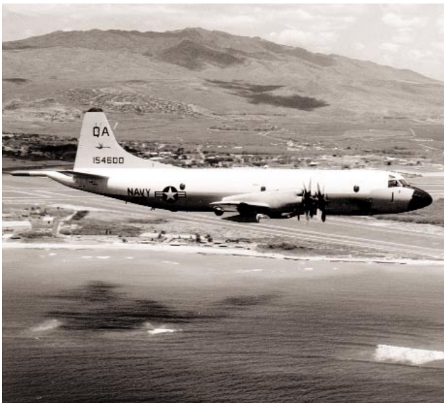
A squadron P-3B in flight near the coast line of Hawaii, August 1973.

29 Aug 1978: A detachment was sent to NAS Moffett Field, Calif., for transition to the P-3B MOD (TAC/NAV) aircraft, returning to NAS Barbers Point, Hawaii, on 31 December 1978.