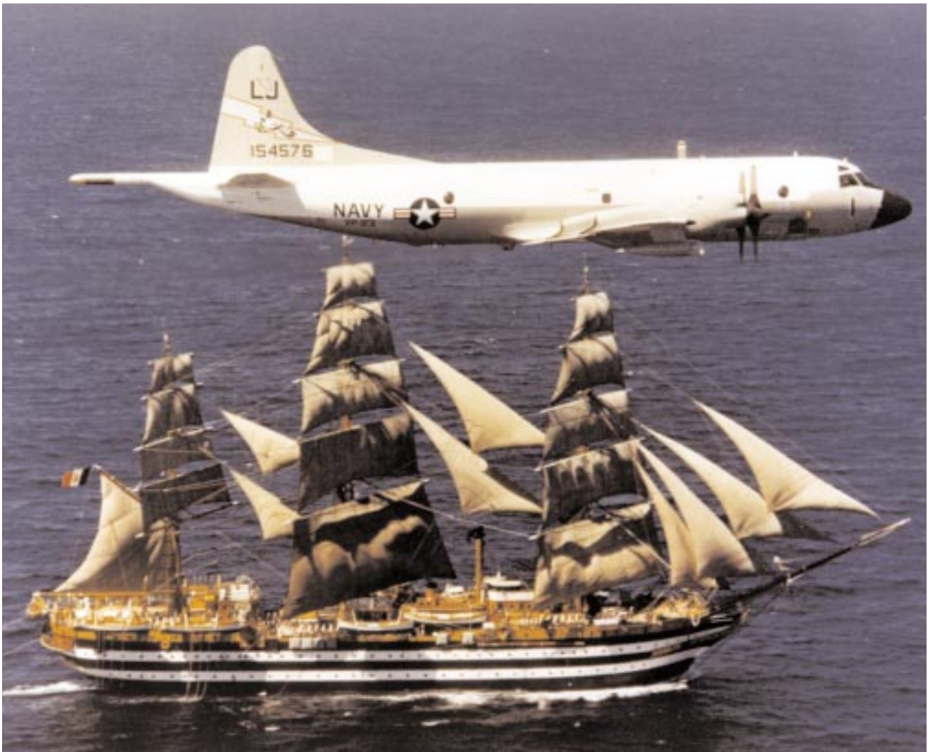
A squadron P-3B flies over a foreign sailing ship.