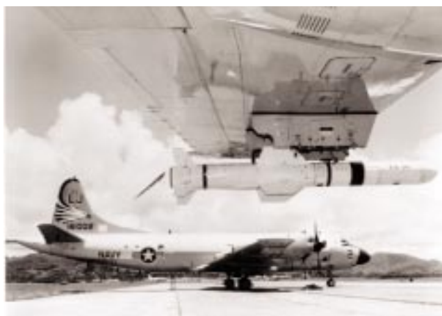
A close up of a Harpoon missile on the pylon of a squadron P-3. A squadron P-3C is in the background.

AGM-84 air-launched antishipping missile. VP-23 was the first operational fleet patrol squadron to make an operational deployment with the Harpoon.