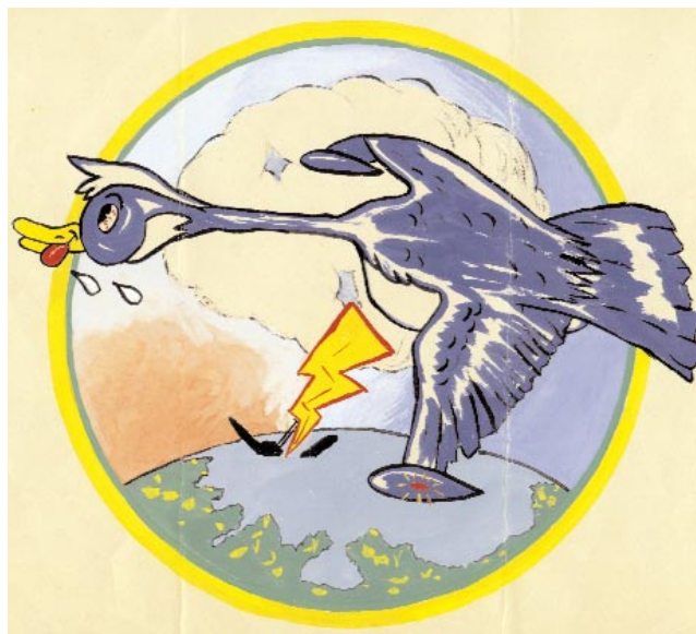
The squadron's second insignia used a cartoon goose to show its mission of long range flights over water.

When VP-HL-2 was redesignated VP-22, its primary mission as a squadron was changed from that of patrolling/bombing to long-range overwater search com-