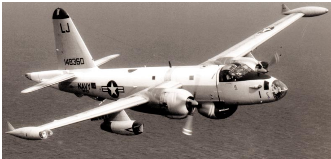
A squadron SP-2H on patrol.