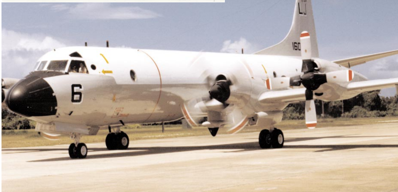
A squadron P-3C, 1979.