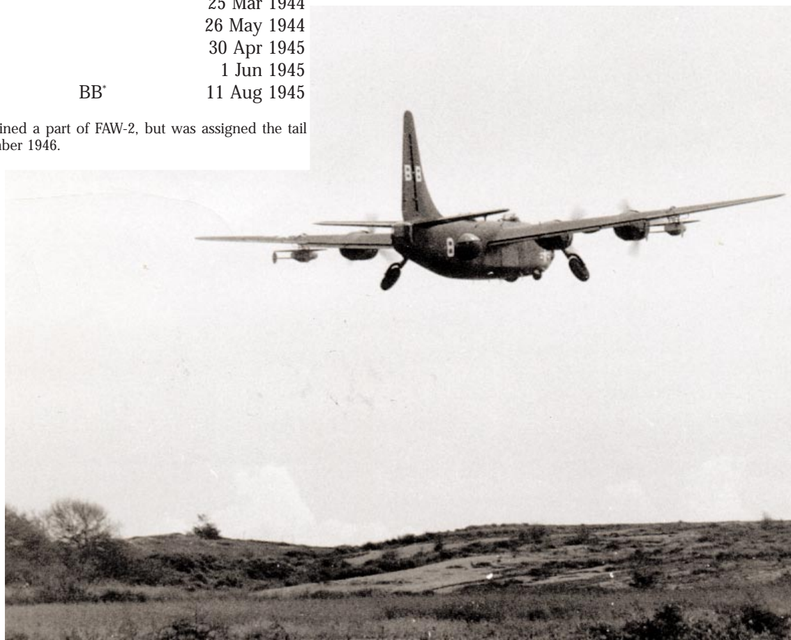
A squadron PB4Y-2 taking off with Bat missiles under its wing, April 1948.