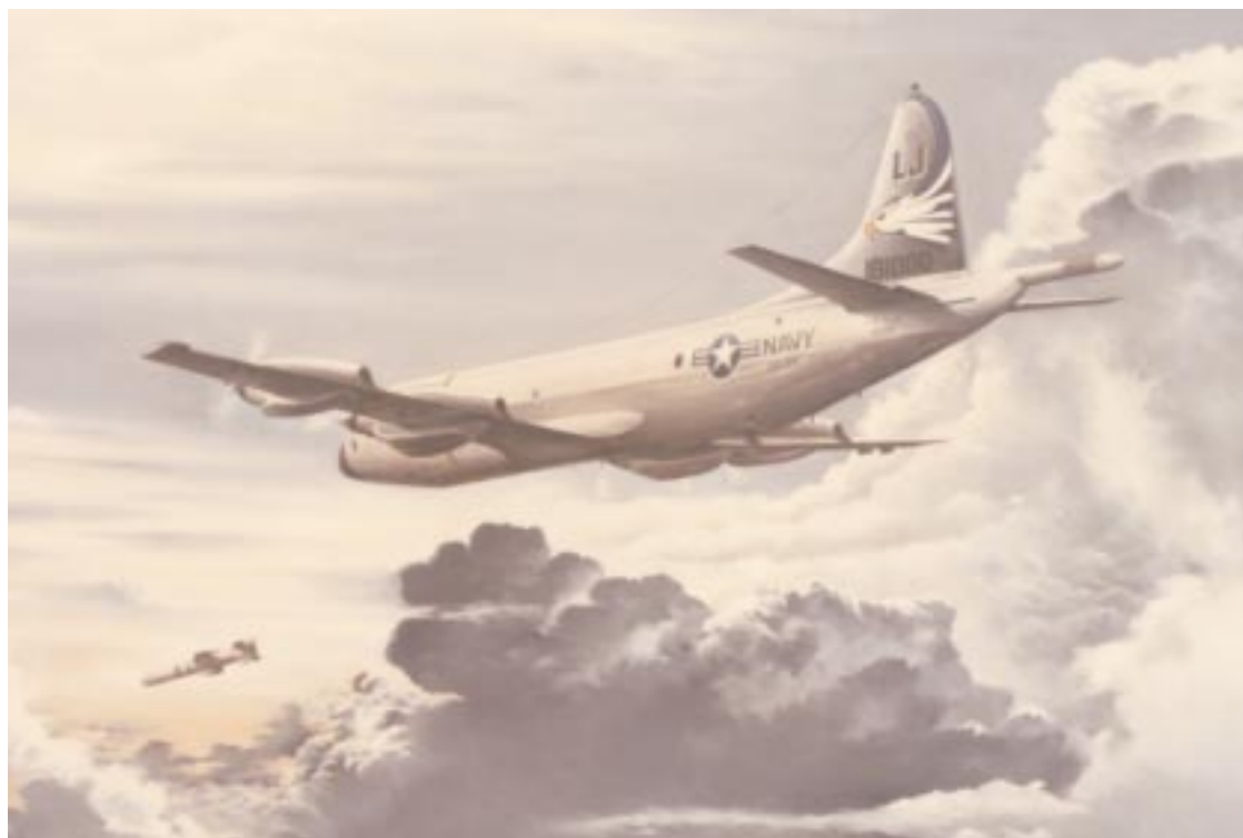
A squadron P-3C launching a Harpoon missile.