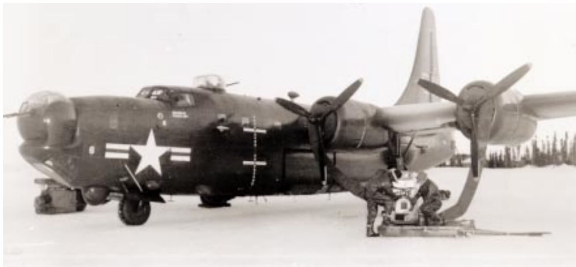
A squadron PB4Y-2 being prepared for flight at Goose Bay, Labrador, January 1950.

19 May 1952: VP-23 deployed to Argentia, Newfoundland, for three months of advanced base training in cold weather operations, relieving VP-24. The squadron flew long-distance reconnaissance flights over the Labrador and Davis Straits and Baffin