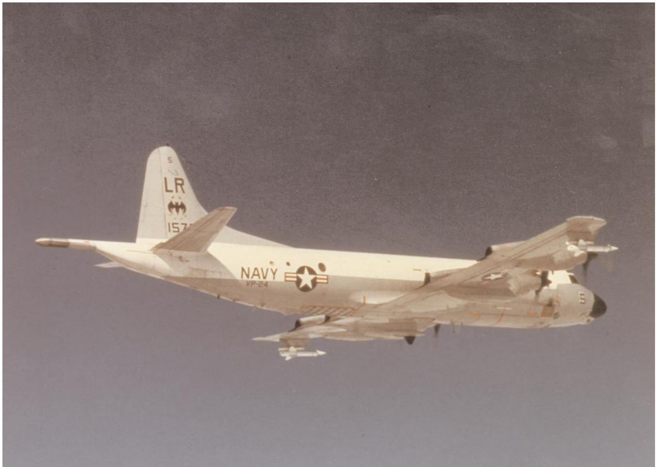
A squadron P-3C in flight carrying two Bullpup missiles.