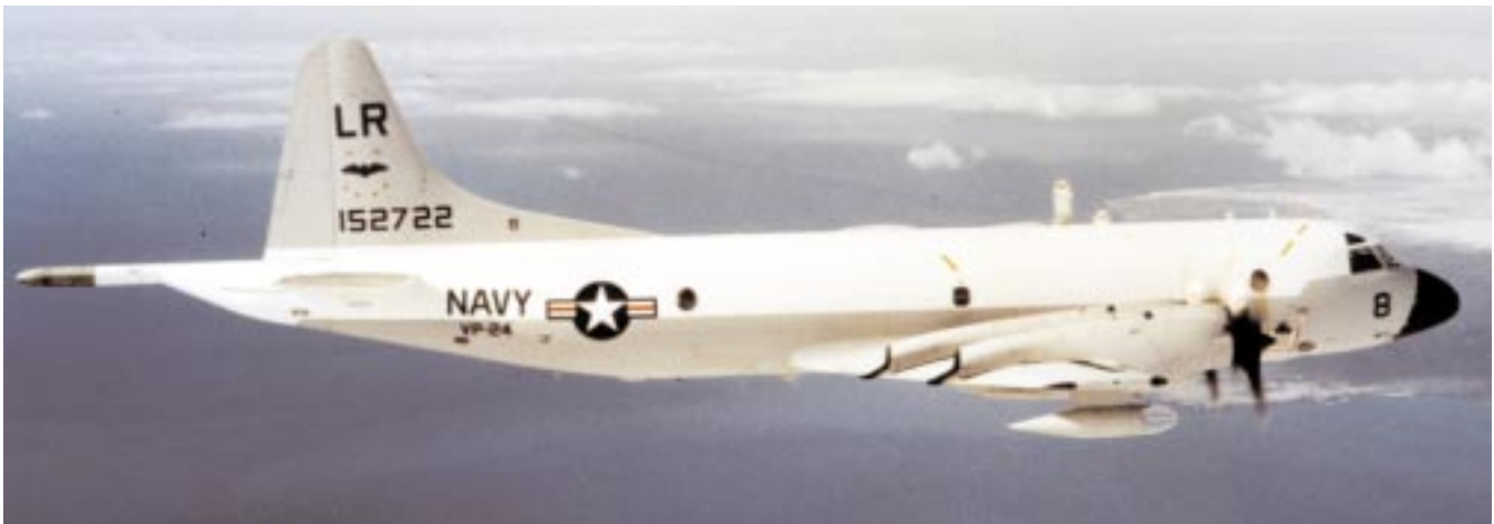
A squadron P-3B in flight.

from 28 May to 25 June 1968. On 5 June 1968, the submarine and her crew were declared “presumed lost.” Her name was struck from the Navy list on 30 June. In late October 1968, Mizar (AK 272) located sections of Scorpion’s hull in 10,000 feet of water about 400 miles southwest of the Azores. No cause for the loss was ever been determined.