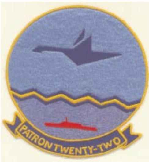
The squadron last insignia was a very stylized goose and submarine design.

would be more appropriate with the advent of the new aircraft. The goose theme was retained, but it was