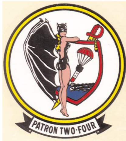
The second insignia continued the bat theme utilizing a Batgirl design.

The second squadron insignia was submitted when the mission of the squadron changed from Bat glide bombs to ASW, reconnaissance and antishipping in 1950. The squadron was so fond of the designation