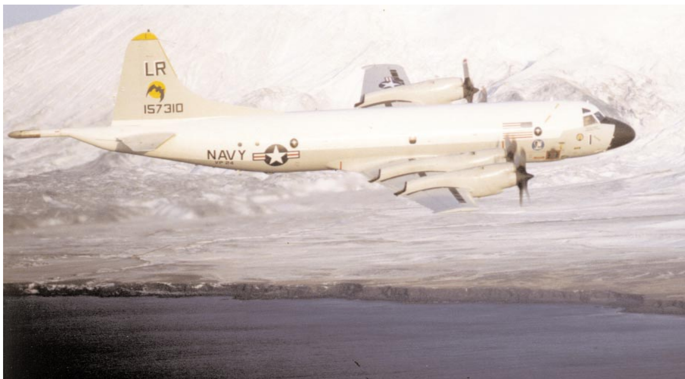
A squadron P-3C in flight, 1984.