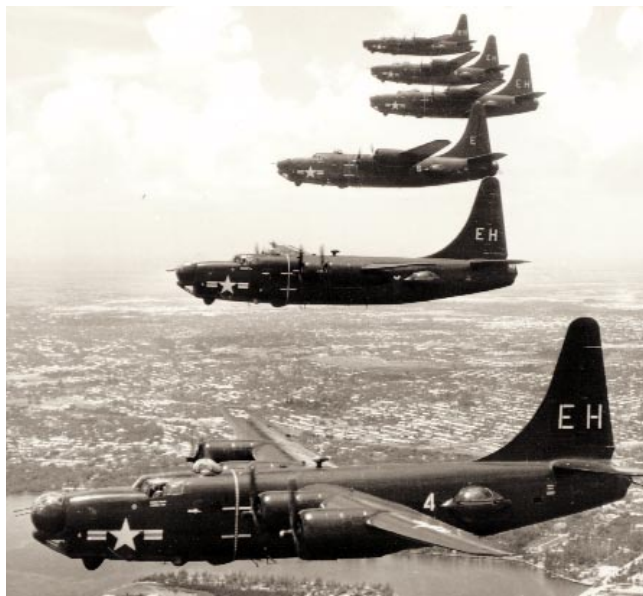
A formation of squadron PB4Y-2s in flight over Miami Beach, Fla., August 1949, 80-G-440198.

1 Jan 1949: After the Navy sequences for the movie Slattery's Hurricane were completed at NAS Miami, preparations for the squadrons transfer to NAS Patuxent River were halted and VP-23 was permanently assigned to NAS Miami under the operational control of FAW-11.