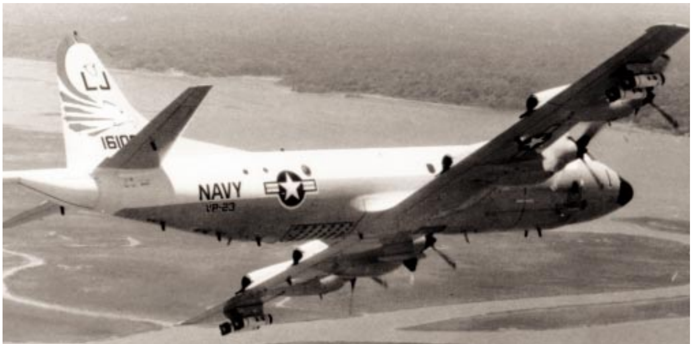
A squadron P-3 loaded with under wing stores.

* The squadron conducted split deployment to two sites during the same dates.