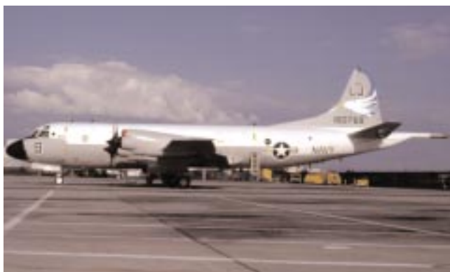
A VP-23 P-3C(U2) at NAS Moffett Field in March 1979.

18 Jul 1979: VP-23 became the first Navy patrol squadron to fire the new McDonnell Douglas Harpoon