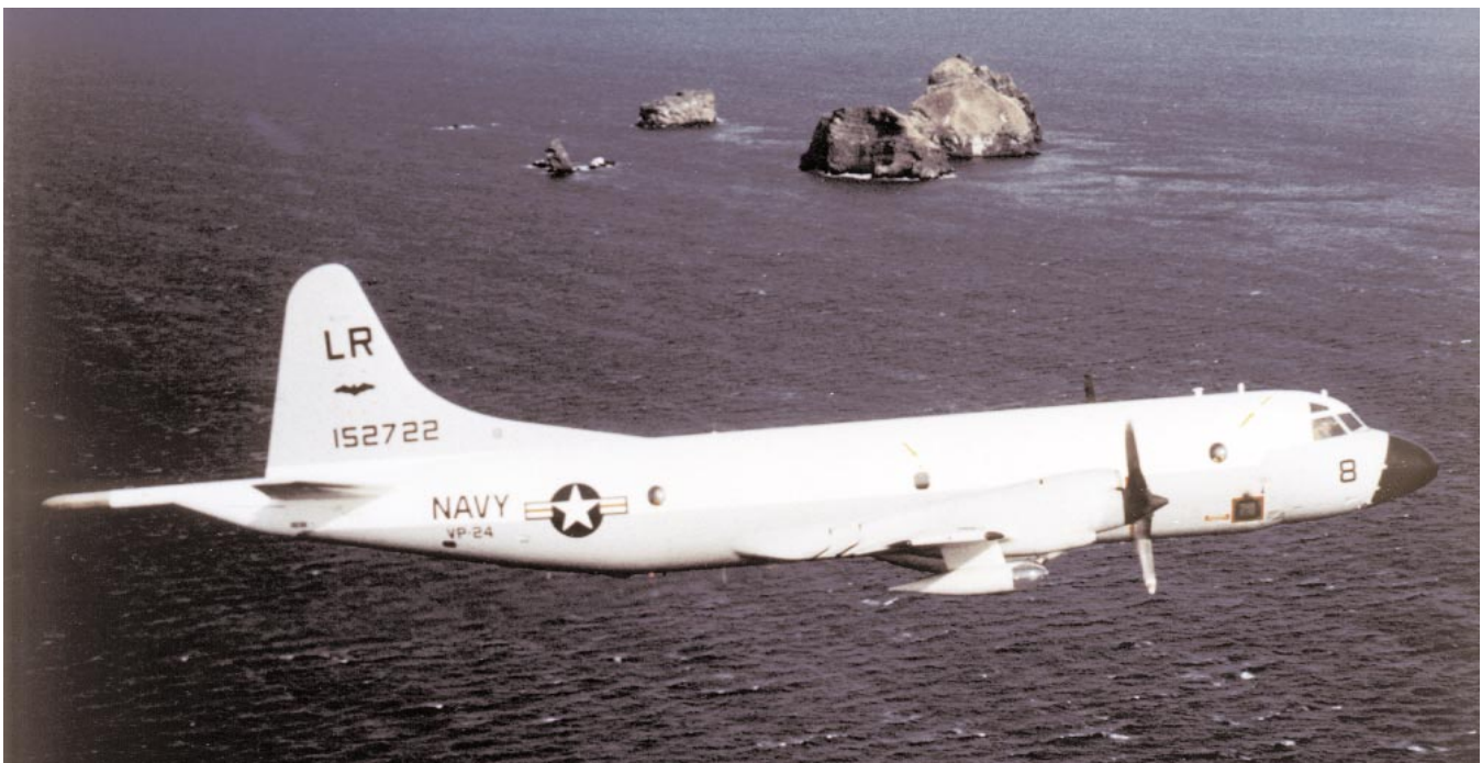
A squadron P-3B on patrol.

30 Apr 1995: VP-24 was disestablished at NAS Jacksonville.