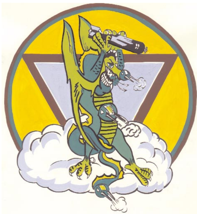
The squadron's first insignia was a dragon.

The first known insignia for the squadron was designed by the author's father while the squadron was being reformed at NAAS Kearney Field, Calif., and was approved by CNO on 29 June 1944. The central figure