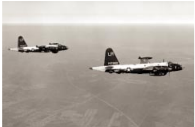
Two squadron P2Vs in flight.

Nov 1959: VP-24 received its first four P2V-7S aircraft. Final delivery of the last of 12 aircraft took place in March 1960.