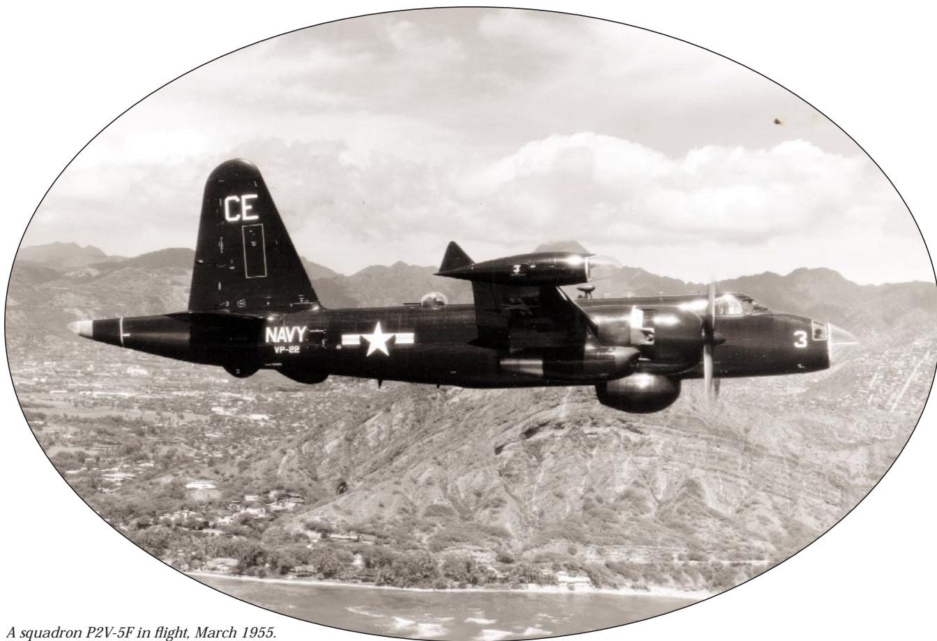
A squadron P2V-5F in flight, March 1955.

21 Apr 1966: VP-22 deployed a detachment to Midway and Kwajalein for advance base operations as part of operation Elusive Elk. The operation involved test firings of intercontinental ballistic missiles (ICBM) with an impact zone in the vicinity of Midway and Kwajalein. All of the squadron crews were rotated for