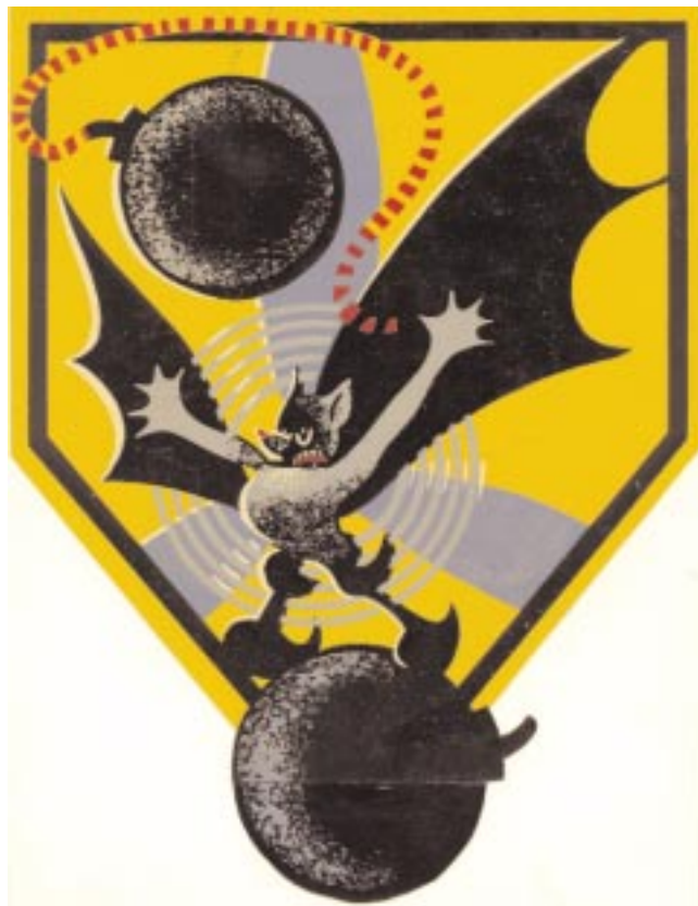
The squadron's insignia was a cartoon bat design.

The first official design was approved by CNO on 30 March 1949. The design featured a cartoon bat that