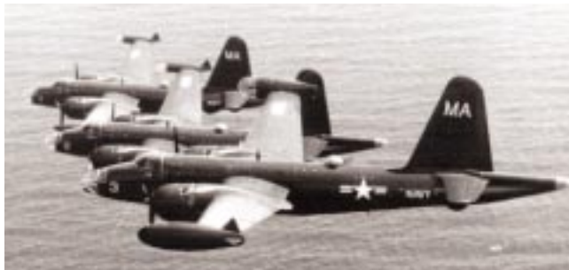
A formation of squadron P2V-5s, April 1954.

29 Jul 1954: A squadron Neptune, MA-7, developed engine trouble during an operational readiness flight near NAS Quonset Point, R.I. The crew ditched with no casualties and were pulled from the water after one and a half hours.