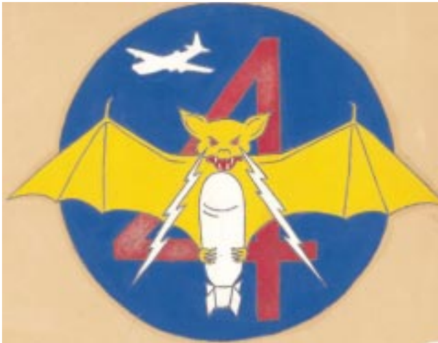
The squadron's first insignia used the bat as its theme in recognition of its capability to launch the Bat missile.

The first squadron insignia on record was designed for VP-HL-4 and was approved by CNO on 9 July 1947. The theme of the design was based on the Bat, or Special Weapons Ordnance Device (SWOD) Mark 9, a