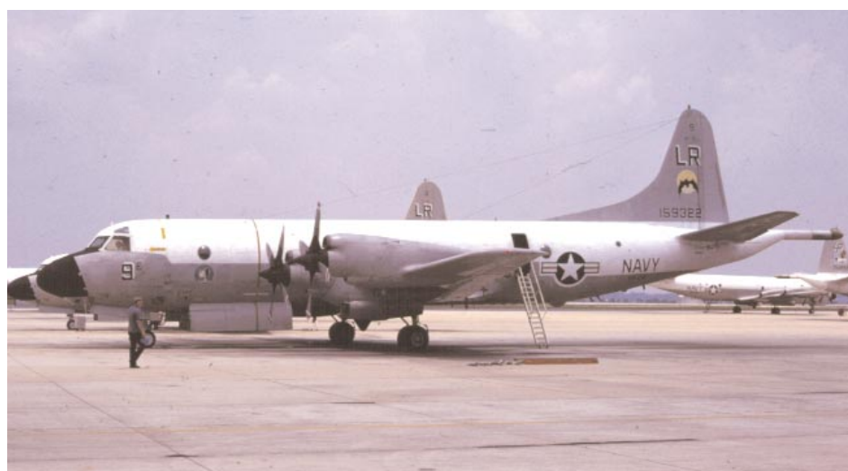
A VP-24 P-3C, September 1979 (Courtesy Rick R. Burgess Collection).

* The P2V-7S was redesignated SP-2H in 1962.