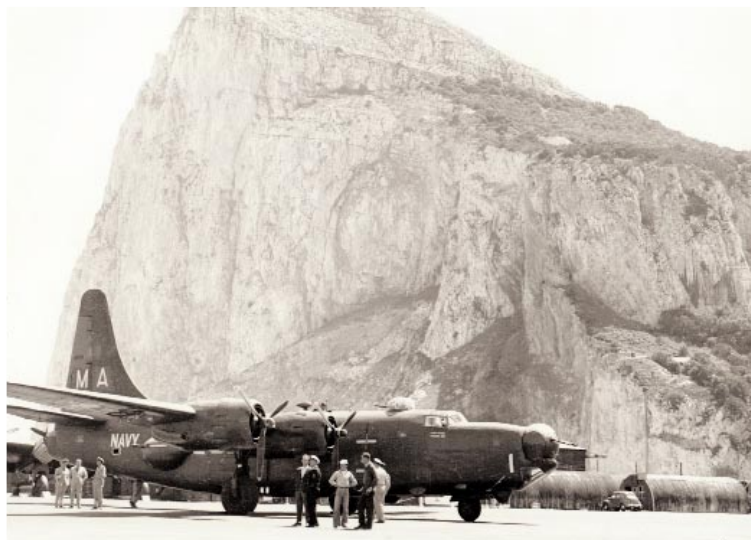
A squadron PB4Y-2 at Gibraltar, January 1951.

Type of Aircraft Date Type First Received PB4Y-2M May 1946 PB4Y-2S Nov 1949 P4Y-2S May 1952 P2V-5 Oct 1953 P2V-7 Apr 1955 P2V-7S (SP-2H) 1959 P-3B Nov 1969 P-3B DIFAR Mar 1971 P-3C UII Oct 1978