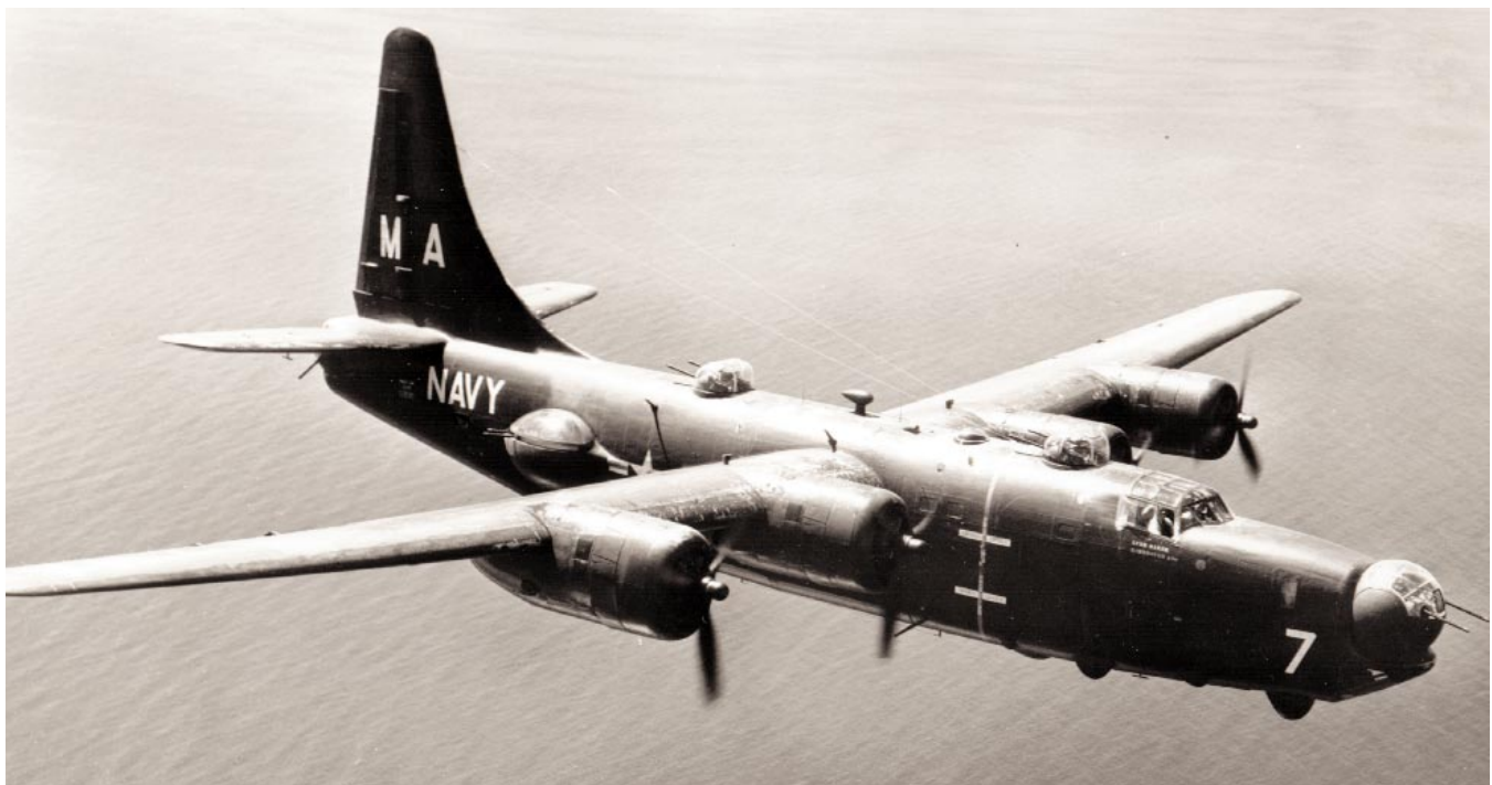
A squadron PB4Y-2 on patrol.