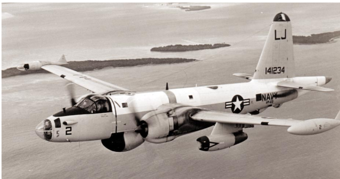
A squadron SP-2H in flight.