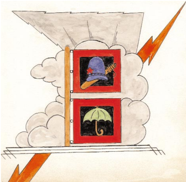
The squadron's first insignia was a complex design of two signal flags.

The squadron's first insignia was approved by CNO on 10 February 1949, shortly after it had been redesignated VP-23. The rather complex design featured two signal flags: one containing the helmet and baton of