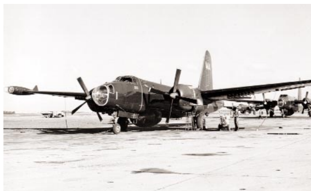
Squadron P2V-5s at Roosevelt Road, P.R., May 1954.

1 Jan 1961: The Seahawks had just deployed to Argentina, Newfoundland, when they received a special assignment. VP-23 was one of several patrol