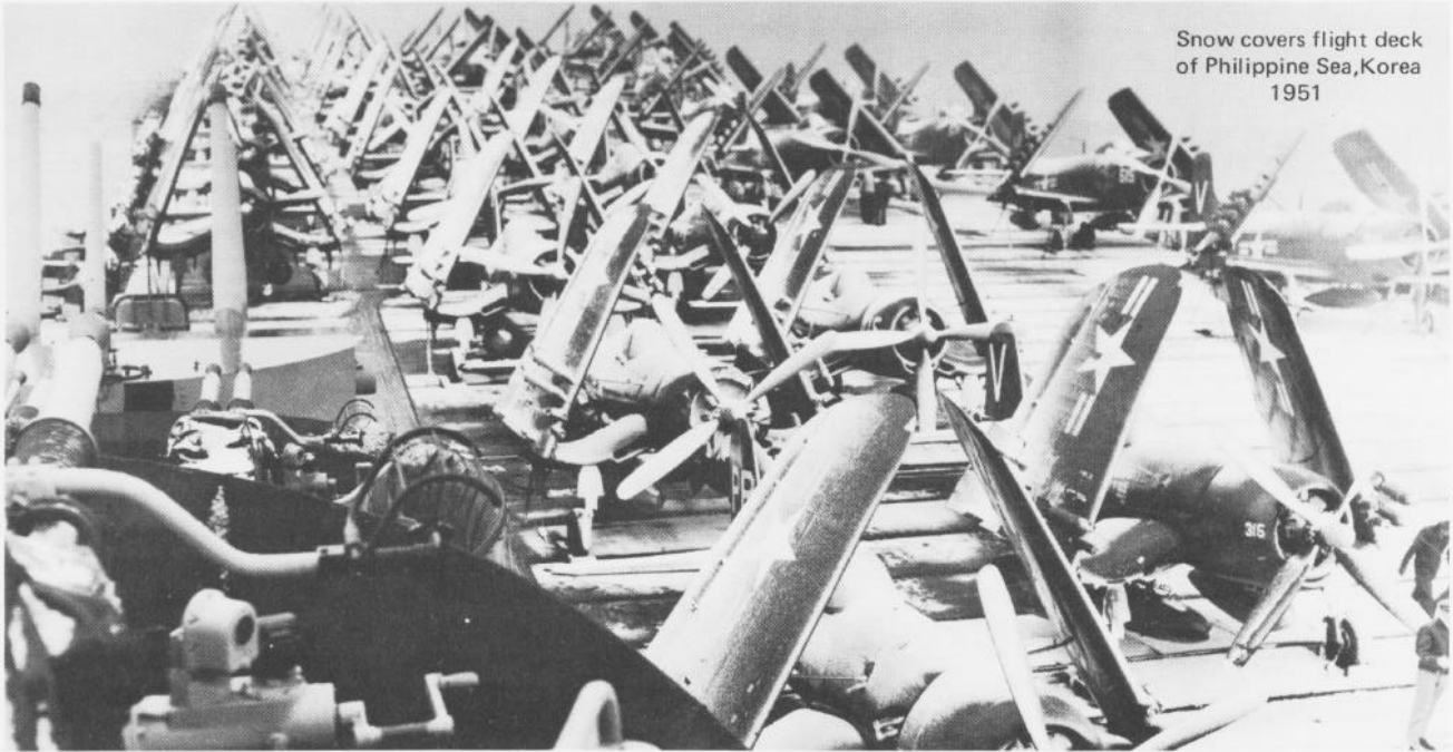
Snow covers flight deck of Philippine Sea, Korea 1951