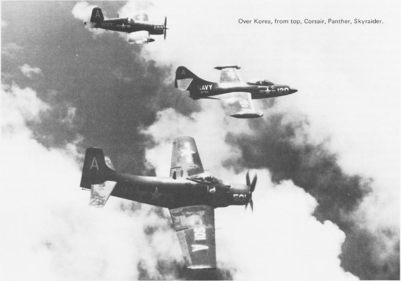
Over Korea, from top, Corsair, Panther, Skyraider.