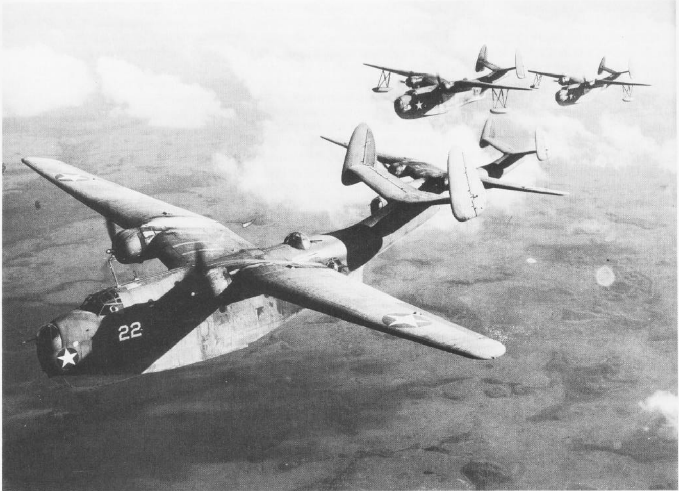
The PBM Mariner evolved as the definitive patrol seaplane during the war.

In May 1943, the Navy watched an Army pilot land a helicopter aboard a tanker in Long Island Sound. In January 1944, a Coast Guard pilot with an HNS helicopter embarked on the British freighter Daghestan . Limited flying was possible on only three days during the mid-winter Atlantic crossing and a Combined Evaluation Board concluded that existing machines were not adequate for ASW.