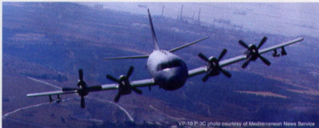
VP-10 P-3C

Five of these Orions were equipped with the Antisurface Warfare Improvement Program (AIP) upgrade, which saw