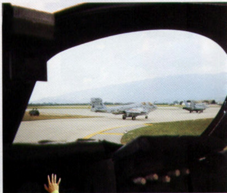
LCdr. Andy Mueller

Reserve Electronic Attack Squadron 209 deployed with a 96-hour notice for Europe. VAQ-209 skipper Cdr. Clay Fearnow said, "Flying an aircraft in high demand and short supply, we knew our squadron EA-6Bs and personnel were needed. [As Electronic Attack Wing, Aviano], VAQs 209, 138 and 140 developed a maintenance effort to maintain 14 Prowlers to meet an around-the-clock flight schedule." Together, they achieved a 100-percent mission completion rate flying over 640 sorties throughout the conflict. One-third of the Navy's EA-6B inventory was dedicated to Operation Allied Force. Below, a flight deck crew member aboard Theodore Roosevelt (CVN 71) directs an EA-6B Prowler after its arrested landing during the operation. Right, a Prowler pilot's-eye view of Canadian F/A-18 Hornets (far right) and a VAQ-209 Prowler taxiing at Aviano Air Base, Italy.