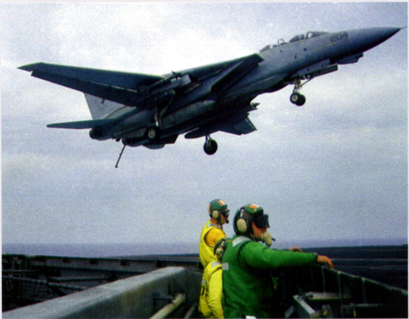
PH11 Dennis D. Taylor

putting steel on target in Yugoslavia. Between 6 April and 9 June, CVW-8 aircraft flew 4,270 total sorties and 3,055 combat sorties—with zero losses—executing the most precise air campaign in history, resulting in the lowest levels of collateral damage ever. These sorties involved essential combat support missions, such as close air support, battlefield airborne interdiction, electronic support and airborne battlefield command and control, as well as strike missions. The Hornets , Prowlers and F-14 Tomcats of CVW-8 destroyed or damaged a total of 447 tactical targets and 88 fixed targets.