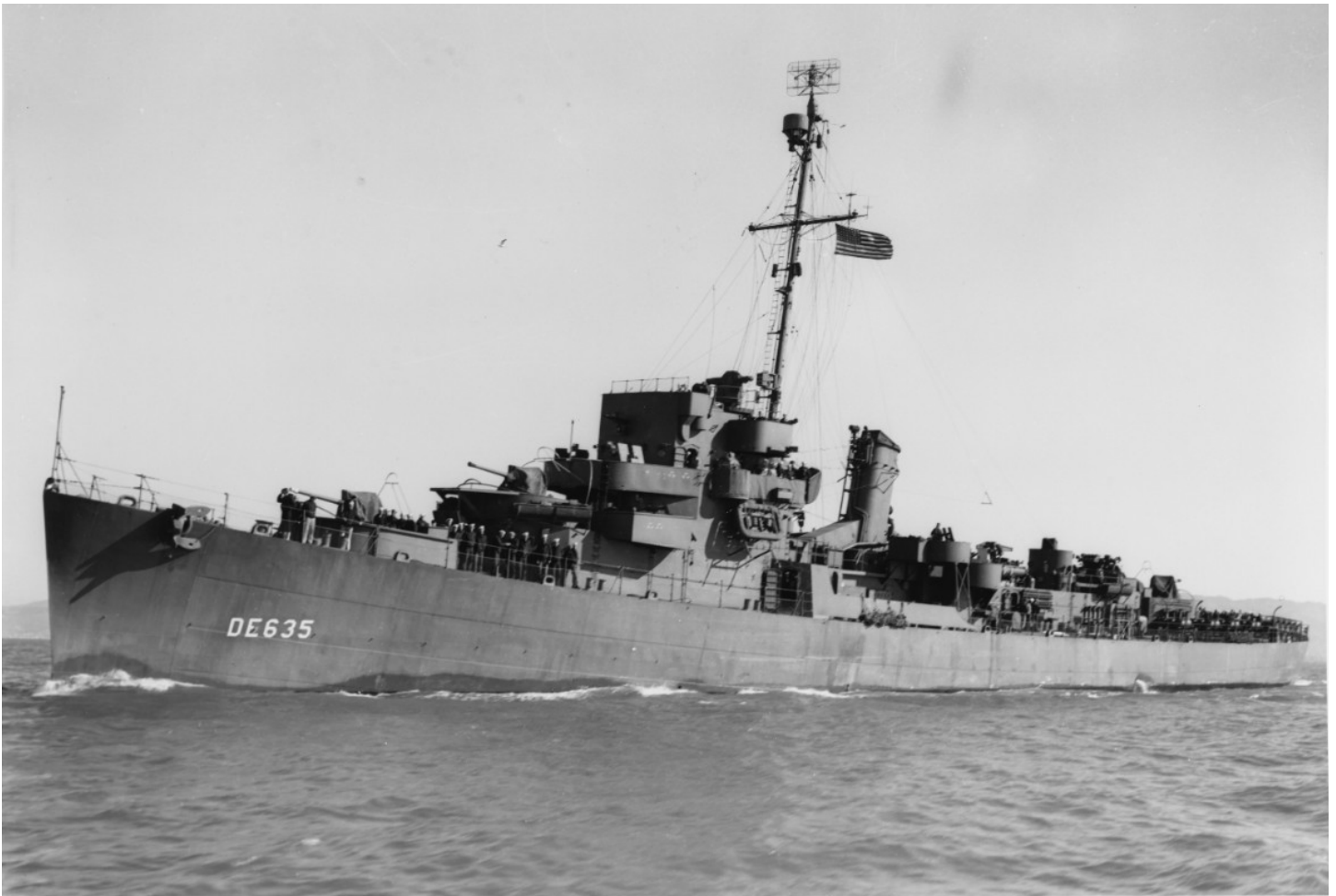
USS England (DE-635) off of San Francisco, 9 February 1944 (19-N-60939).