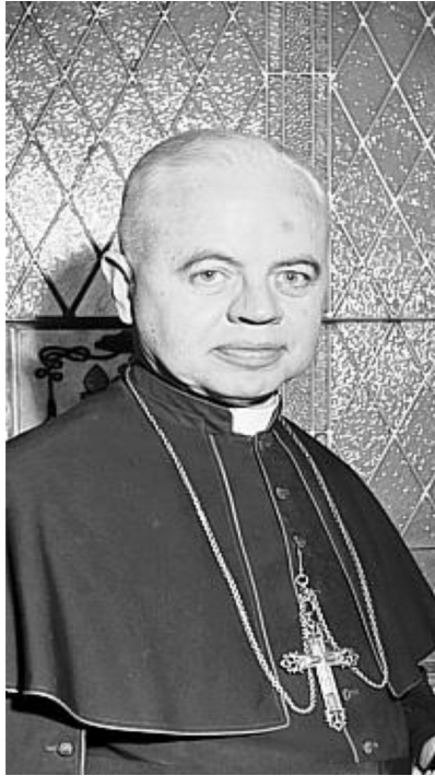
Bishop Philip Pocock