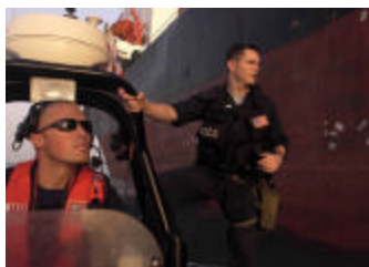
FIGURE 3 COAST GUARD LEDET BOARDING

LEDETs deploy onboard Coast Guard cutters, U.S. Navy ships, and naval vessels of U.S. allies to conduct counterdrug law enforcement operations. 39 LEDETs were originally disbursed throughout the Coast Guard under the operational control of local Coast Guard commands. LEDETs are now consolidated into three regional Tactical Law Enforcement Teams (TACLETs) with expanded missions under the operational control of Coast Guard Area Commanders. A number of LEDETs form the core of the TACLET. Although the primary mission remains counterdrug operations, TACLETs also “support, train, and augment Department of Defense (DOD), foreign, federal, state, and local law enforcement with personnel highly trained in all aspects of maritime law enforcement. 40 TACLETs/LEDETs are not self-contained like PSUs and MSSTs and rely on the small boats of ships on which they deploy as boarding platforms.