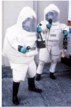
FIGURE 4 COAST GUARD STRIKE TEAM

The Coast Guard, through its National Strike Force Coordination Center, maintains three hazardous materials strike teams on each coast of the United States for rapid response to hazardous material spills in the maritime and port environment. This includes deploying overseas to assist foreign governments or in support of the geographic command commanders. For example, the strike teams deployed during the first Gulf War to provide a unique response capability for oil and chemical tanker spills during the armed conflict and as Saddam Hussein environmentally sabotaged the oil fields during the Iraqi retreat from Kuwait. 42 Under a more recent concept of operations, strike teams are deploying to support Military Environmental Response Operations (MERO) in Operation Enduring Freedom and Operation Iraqi Freedom 43 and as part of the U.S. military contingent conducting tsunami relief efforts. 44 The strike teams have been specifically trained and are capable of responding to chemical, biological, radiological, and nuclear (CBRN) threats and can also operate in a WMD environment. 45 In fact, the strike teams maintain an active liaison with the U.S. Army Chemical Weapons School. 46