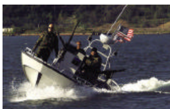
FIGURE 1 COAST GUARD PORT SECURITY UNIT

Currently, the Coast Guard is actively supporting Operation Iraqi Freedom through maritime interception operations (MIO), coastal security patrols, and port security missions. Deployed assets include cutters, law enforcement detachments, and PSUs. However, it is