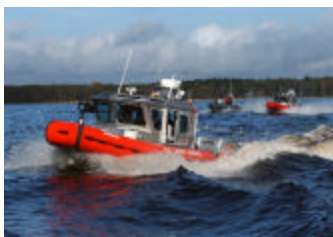
FIGURE 2 MARITIME SAFETY AND SECURITY TEAM

After 9/11, the Coast Guard quickly established several MSSTs to close vulnerabilities in the nation’s ports. 33 MSSTs are specialized, self-contained small boat units, with a mix of active