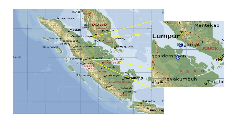
Figure 3. Sumatra's Riau Region

practiced. The government is democratic and headed by an executive branch with democratic policies reinstituted in 1998 as a result of the Reformasi movement. The president of Indonesia is Dr. Susilo Bambang Yudhoyono who entered office in 2004 on the heels of a hotly contested national election. A primary reason behind his popularity is the "Clean Government" platform on which he campaigned. He has demonstrated he is a champion of " Reformasi " and has proved open to improved US-Indonesian cooperation. <sup>39</sup>