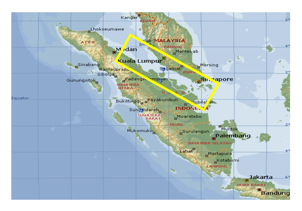
Figure 1. Strait of Malacca