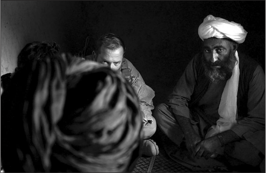
Figure 12. Strategy meeting: Operational Detachment-A working by, with, and through others, 26 September 2004.

with civic action to remove the causes of instability. The five primary causes of instability were (and are) lack of security; lack of structured national, provincial, and district governments; lack of infrastructure; widespread illiteracy; and illegal commerce. Commanders fostered relations with tribal elders, company level military leaders, and international/relief organizations' efforts to work quality of life efforts for the Afghan people.