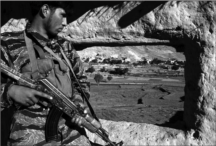
Figure 13. Soldier from Afghan Security Forces on patrol in Nuristan, Afghanistan, 10 May 2004.

enough, we found repeatedly during the Afghan campaign that the best intelligence and the most effective operations were developed from the tactical units themselves. This observation is a very key point in conducting COIN operations—COIN is bottoms up, not top driven. Oddly enough, in our military system, plans and orders are developed at the higher echelon and delivered to the executing unit. The difference in Afghanistan was that subordinate commands developed and proposed operations to the CJTF headquarters and once approved by the commanding general, the approved concept of operations were executed. This was the case for Operation Princess, and in fact the other operations during the campaign. The concept of operations came from the executing unit, which was received by the J5, codified into an overall operations plan, then published as an operations order back to the executing command once the CJSOTF-A commander approved the plan.