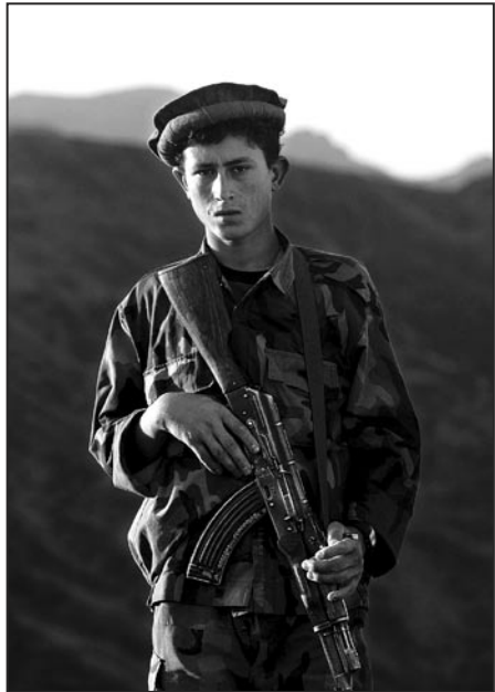
Figure 5. On guard: Afghan Security Force trooper, 22 October 2004.

The Afghan guerrilla was petrified of capture. When captured, once "gallant" Afghan guerrilla fighters appeared nothing more than sniveling cowards. Such was the case with the guerrilla leader who was captured one morning in a strike operation. He was building a car bomb for a target in Kabul, perhaps the American Embassy. A strike package was launched and placed under U.S. control against the guerrilla leader. His entire demeanor changed when he was brought back to the coalition base. However, what did not change was his pure unadulterated hatred for the coalition.