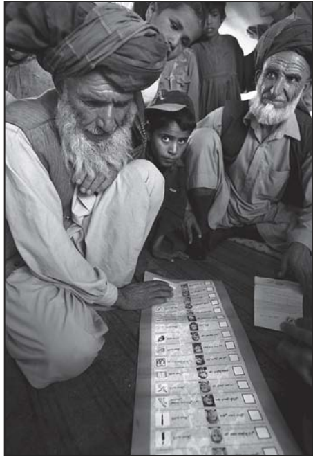
Figure 14. Ballots printed and ready to vote, 6 October 2004.

Employing the fundamental principle of counter guerrilla operations, the CJSOTF-A conducted a series of JTBS, identified the enemy sanctuaries, estimated their timeline to attack the major population