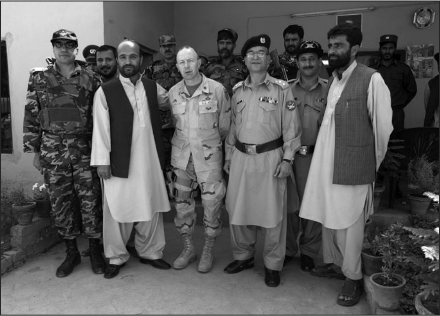
Figure 15. Afghan, Pakistani, and U.S. civil and military leaders conclude a tripartite meeting at Torkham Gate, Afghanistan, 8 April 2004.

emerging government of Afghanistan, which achieved the results desired: a recognized government of Afghanistan involved in cohesive conversations with the Government of Pakistan in recognizing and respecting the border. The means to do so was by military discussions on interdicting guerrilla cross border movement.