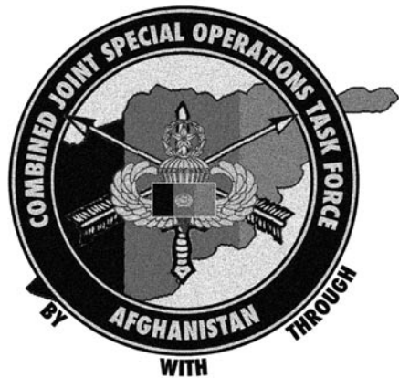
Figure 1. CJSOTF-A motto: “by, with, and through” others.

Some armchair generals, legacy-thinking academics, and poorly informed professionals may say that we will not conduct UW in modern times. They think that if you don't parachute into occupied territory, link up with a partisan group, and overthrow an occupying army like the OSS did six decades ago, it is not UW. In fact, we are conducting UW every day in this war. We have over a dozen Special Forces (SF) A-camps in Afghanistan alone tasked to do UW. The vast majority of the actionable and reliable intelligence we have in that region comes from SF troopers working by, with, and through others. In more cases than not, it is the