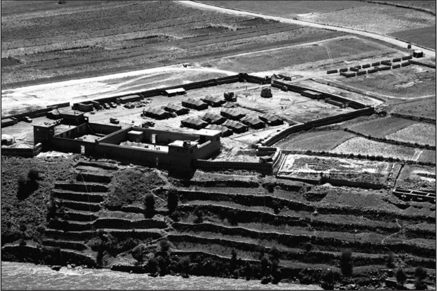
Figure 6. A SF base camp, northeast Afghanistan, 9 March 2004.

profit from the drug trade. Finally, the HiG wanted what the Taliban wanted, instability to continue to survive to outlive the coalition intervention in their homeland.