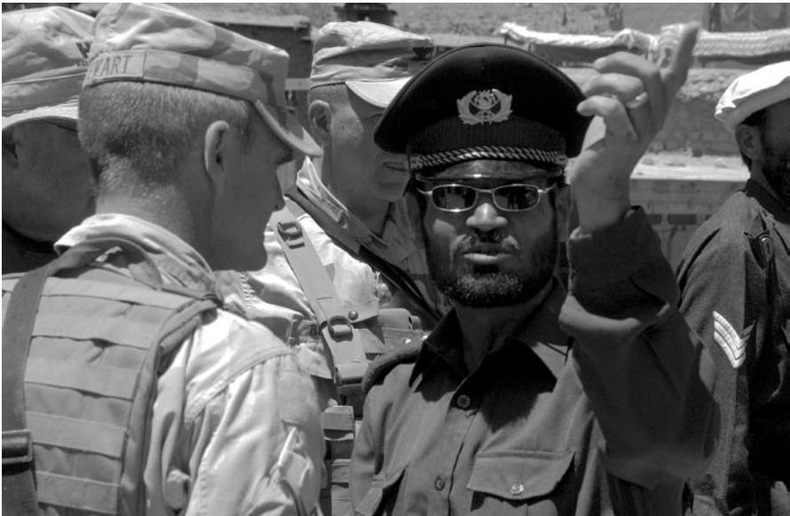
Figure 18. Establishing stability: U.S. officers meet with Afghan officials prior to an Afghan-Pakistani border security meeting in Chitral Province, Pakistan, 18 May 2004.