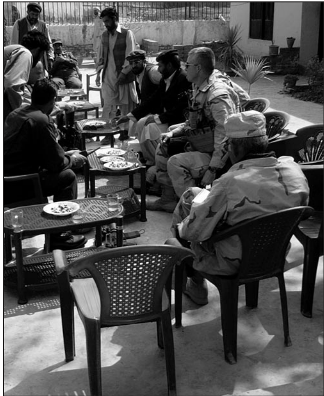
Figure 2. Face to face with Afghan, Pakistan, and American leaders to discuss border security, 9 March 2004.