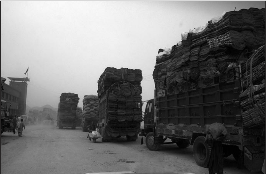
Figure 7. Jingle trucks heading into Afghanistan from Pakistan in October signal improvement for the legitimate economy.