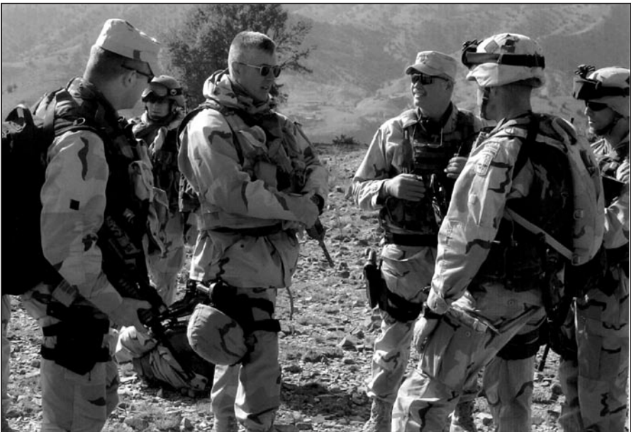
Figure 10. CJSOTF-A command visit to SOF unit in Afghanistan, 14 June 2004.

Battlefield circulation. The commander must always see the battlefield for himself. He needs to understand how his command can dominant the fight and defeat the enemy. To do so, he must be away from the headquarters and be among the soldiers. A commander isolated by his staff and subordinate commanders fails to command because he has relegated his responsibilities to others, in turn leading from behind, not from the front. Every Monday after the CUB, the commander, command sergeant major, and selected staff would fly to visit an SF unit (battalion, company, and/or detachment) at one of the SF base camps. The purpose of such visits was to see first hand the operational effectiveness of the unit(s), conduct face-to-face coordination with key leaders, observe the interaction between the officers and the noncommissioned officers, assess the living conditions of the base camps, ensure combat readiness, and understand the