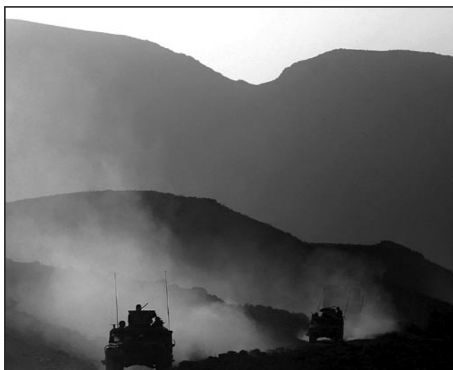
Figure 16. Operational Detachment-A on patrol in Afghanistan, 26 September 2004.

It is easy to focus on combat operations, but our strategic objectives were two-fold: establishing security while helping the nation and its people. The next section discusses the nature of the planning and operations for civil-military COIN operations.