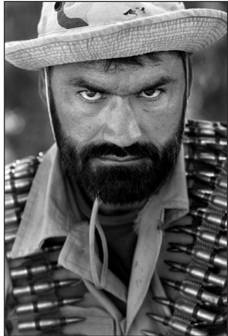
Figure 4. On the Afghan border with Pakistan, 23 October 2004, Afghan Security Forces soldier supporting SF COIN operation.

A great appreciation of the enemy's structure came from reading U.S. Army doctrine from the 1950s, 1960s, and 1980s. Surprisingly, these earlier writings were near exact in the enemy's organizational construct and tactics. Hence, looking at the Afghan insurgency of 2004, the following detail was derived.