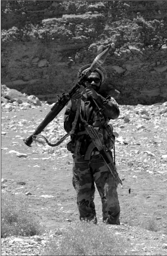
Figure 19. Success came one valley at a time; here an Afghan irregular participates in offensive combat operations with coalition forces 13 May 2004.

In December 2004 as the campaign concluded, the incumbent CJSOTF-A transferred authority from the 3rd Special Forces Group (Airborne) to the 7th Special Forces Group (Airborne). Its charge was to execute Operation Yorktown and bring combat operations in Afghanistan to the next level. ↑