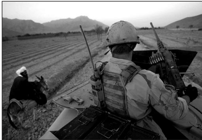
Figure 8. On patrol in Afghanistan, 23 September 2004.

Operational command and control. How the command executed operations was the primary responsibility of the command group, which included the commander, deputy commander, executive officer, and command sergeant major. This group managed the functions of the command in an interactive construct that empowered leaders to lead and work within the set of priorities, parameters, and resources available for combat operations.