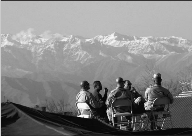
Figure 10. Commander's strategy meeting with principal staff, 1 February 2004.

The command sergeant major, as the senior enlisted advisor, played a key role in the command. In an organization where the preponderance of the force consists of noncommissioned officers, the command sergeant major worked with the senior enlisted of the subordinate commands to ensure compliance with directives, sustain morale, and maintain battlefield discipline.