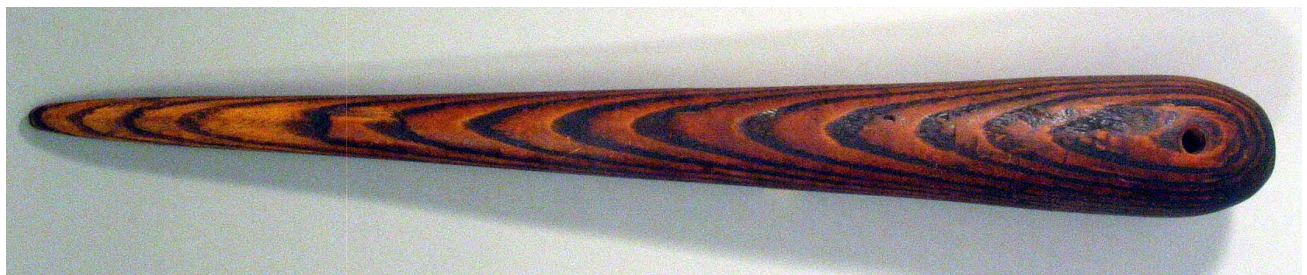
Knife, marlinspike, and fid.

Ropes could be rove through a dozen different kinds of blocks, as well as hearts, euphroes, and trucks, and be attached to deadeyes and cleats. Seamen learned how to rig ropes and blocks into a variety of tackles for specific purposes.