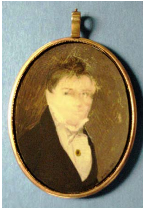
Below: Miniature portrait of Asa Curtis, watercolor on ivory, artist Doyle, early 1800s. Navy Department Library, Washington, DC, ZB Files, Asa Curtis.