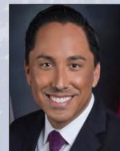
Todd Gloria (D-San Diego)