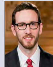
Scott Wiener (D-San Francisco)

The stakes for the Labor Movement have never been higher.