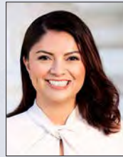
Lena Gonzalez (D-Long Beach)