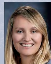
Buffy Wicks (D-Oakland)