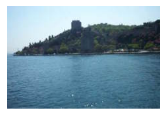
Figure 2. A view from Rumelihisari.