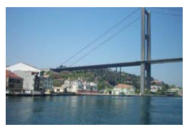
Figure 6. The Bosphorus Bridge.