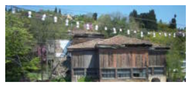
Figure 7. Amcazade Huseyin Pasa Yalisi, one of the oldest waterfront buildings in Istanbul (date:1699).

It is sad to state that the most of the waterfront houses of the 19<sup>th</sup> century doesn't exist now and those that could be preserved stand like stangers among their new neighbours most of which do not even bear a sign of the ones they have replaced.