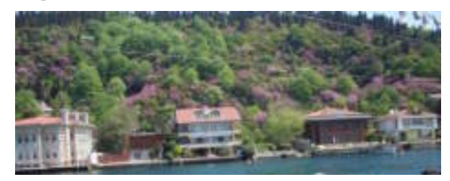
Figure 4. Waterfront buildings with the natural vegetation.