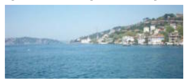
Figure 5. A view from slopes of the Bosphorus.