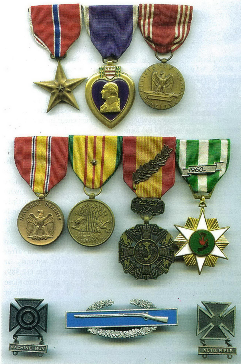
Figure 1: Medals and badges awarded to Corporal Larry Dale Palmer.

Larry Dale Palmer SP 4 – Army – Selective Service 196th Light Infantry Brigade 20 year old , Single, Caucasian, Male Born on November 13, 1949 From Greensburg, Pennsylvania Tour of duty began September 10, 1969 Casualty was on February 20, 1970 Hostile, Ground Casualty Multiple Fragmentation Wounds Body was recovered Religion – Protestant Panel 13 W - - Line 37