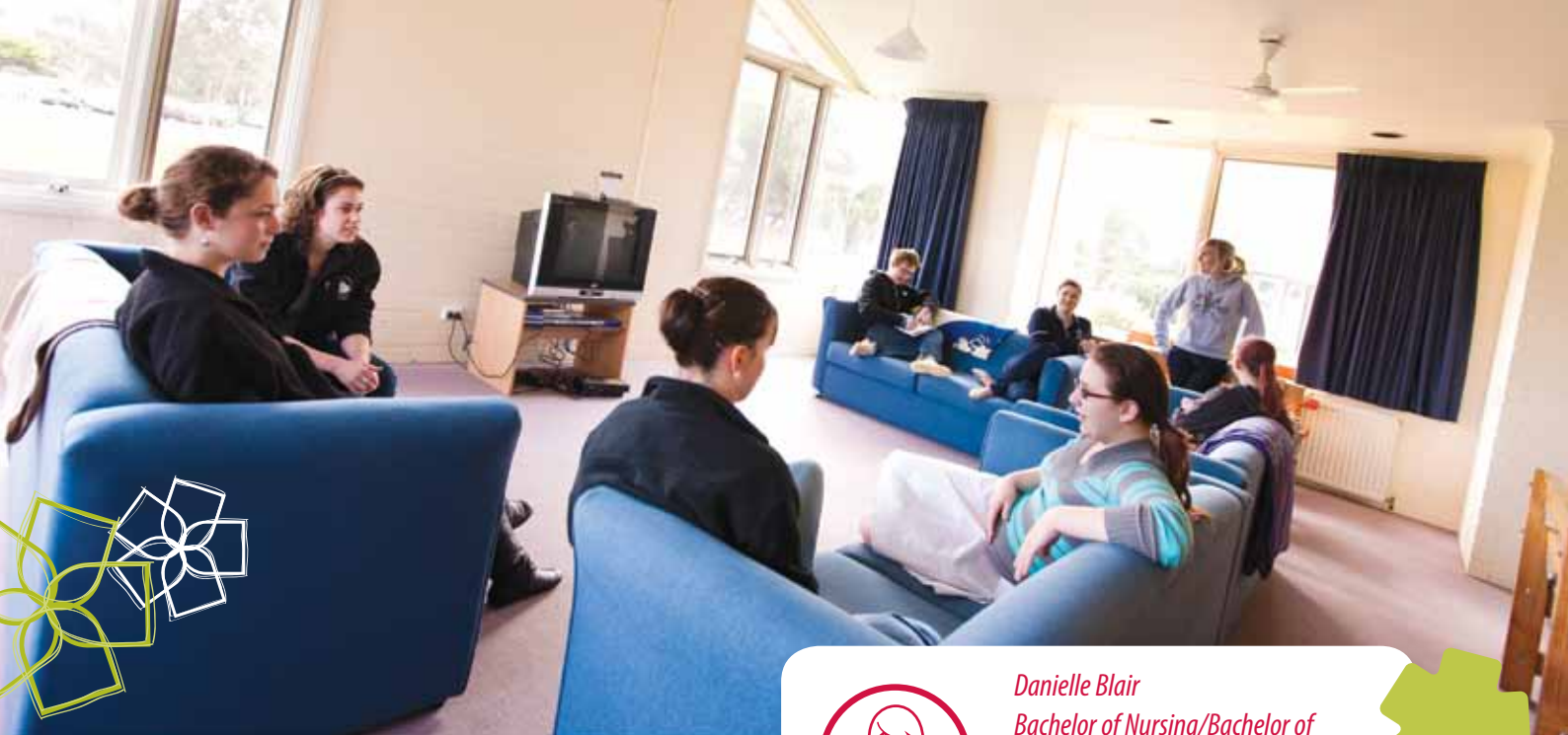
Warrnambool student residences