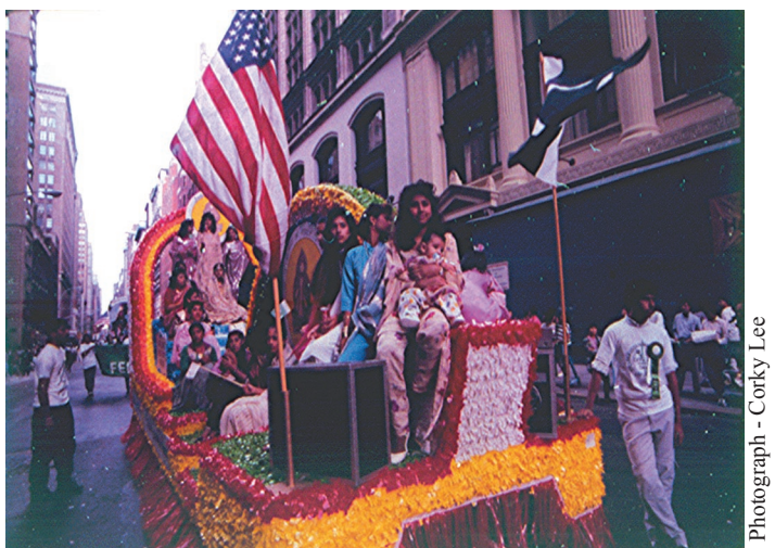
Pakistani Independence Day Parade - Lexington Avenue, New York

Among noteworthy features, census data show that New York City's Pakistani population more than doubled from 1990 to 2000. In addition, in 2000, Pakistani New Yorkers had substantially lower English skills, lower incomes, higher poverty rates and larger households than New York City residents overall.