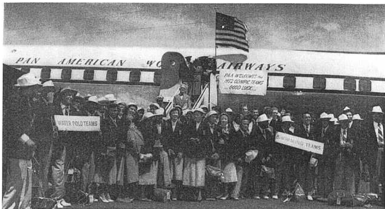
Aquatic teams take off from Idlewild, destination Helsinki.