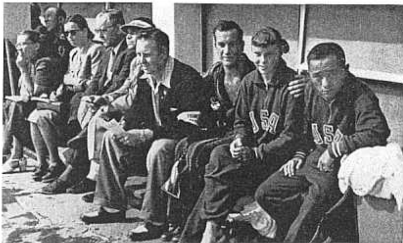
Divers divers watch divers diving