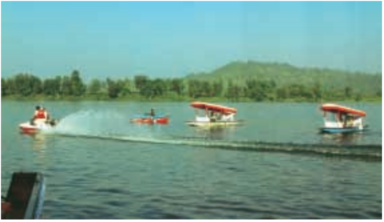
Boating at Dudhni

of their attire, the shining coats, designer crowns and their majestic walk on the forest floor is no less than any fashion parade. The machan (watch tower) near the waterhole provides panoramic view of the sanctuary.