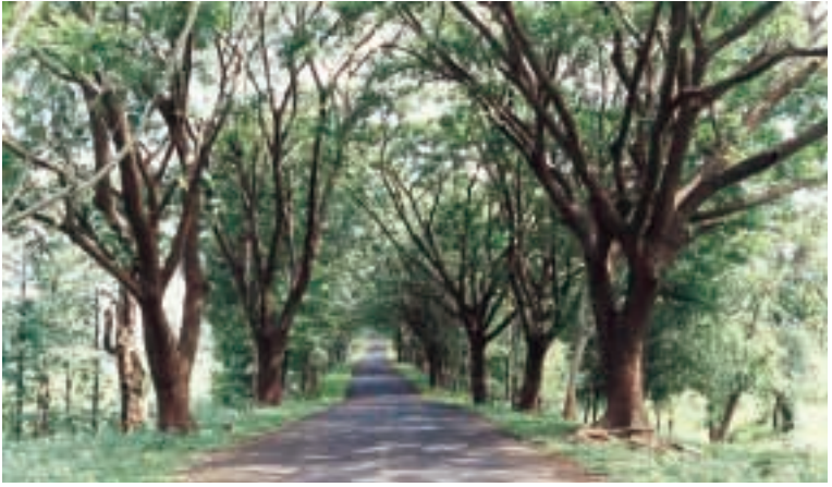
The nature's delight