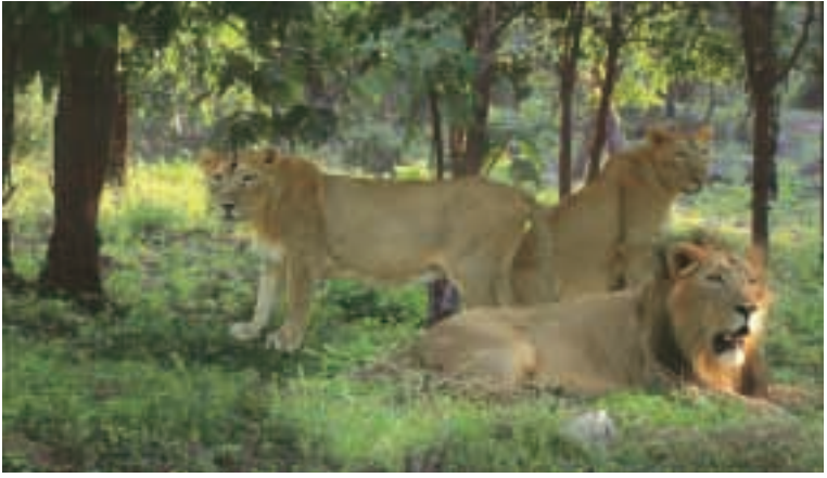
Lion Safari, Vasona

family of lion the king, Kush and his consorts, Silky and Sonal brought from Sakarbaug Zoo at Junagarh in Gujarat. Entry Adult Rs. 25 Kids Rs. 10. Timing 1000-1700 hr. Monday closed.