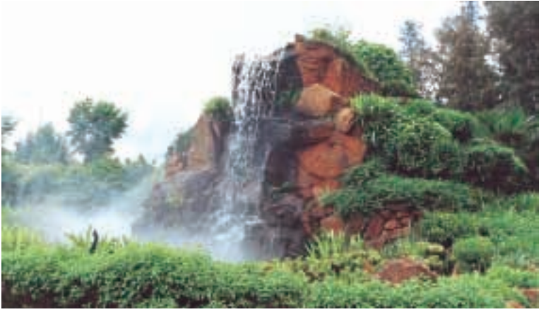
Hirwa Van Garden, Piparia

The Hirwa Van Garden , Piparia on the Silvassa - Dadra road is a beautiful garden with rustic stone walls, misty cascades, twin arches, springy lawns interspersed with colourful flowers, roaring water falls and tiny kiosks. Entry Rs. 2 Timing 1000-1800 hr. Tuesday closed.