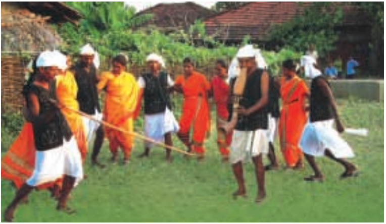
Music, rhythm and celebration - Tarpa dance

stick ( ghol kanthi ) in a rhythmic beat. The other performers hold each other around the waist and wind their way round the musician. The man plays on the Tarpa, a wind instrument fashioned from gourd and bamboo sticks. The pace of dance and steps change with the tune played by the musician on the Tarpa. The music sounds much like a snake charmer's hypnotic tune.