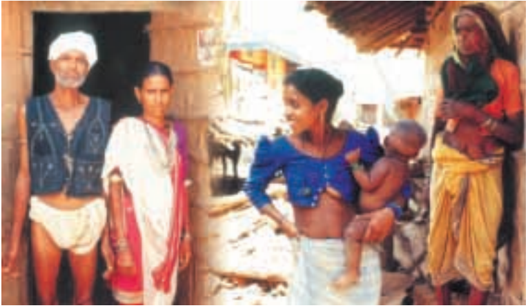
Simple, colourful tribal folks of Dadra & Nagar Haveli

adjoining areas of Maharashtra. They live in small thatched huts (locally called Dhundi) and are cultivators and a majority are land owners. The traditional wardrobe of the Dhodia men is a white dhoti upto the knees and a shirt or waist coat with a white cap and they wear ornaments such as earrings and silver chains around the waist. The dress of a female consists of a dark blue saree worn upto the knees with colourful bead necklaces, metal bangles on wrists and thick metal kadas around their ankles.