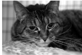
I'm a Sidekick

Every cat has his or her own feline-ality, just as every person has his or her own personality. Meet Your Match aims to match you with the cat that's right for you and your lifestyle, helping create a lifelong bond that virtually nothing can break. The program identifies a cat's traits, or "Feline-ality", including playfulness, acceptance of handling, boldness, sociability and even talkativeness. By determining a cat's Feline-ality, we will be able to help adopters find the cat that best meets their expectations of cat ownership. Research shows that when this expectation is met, a strong human-animal bond is formed. By assessing how cats act in a shelter surrounding, we can better predict how they might act once they are in a home environment. As a result we will be able to give new adopters more information about what behaviors to expect from their new cat. For example, cats that are talkative in the shelter are likely to be chatterboxes in a home while cats that show an interest in toys are likely to be playful with their family. Nine "Feline-alities" make up the Meet Your Match matrix, categorized into a color-coded system of purple, orange and green to help adopters easily find their match. Are you searching for a companion to help with all your daily chores? An orange "Personal Assistant" might be what you're looking for. Or how about a green "Leader of the Band"? Regardless of your lifestyle, we have the cat for you! Visit MEOW and Meet Your Match today!