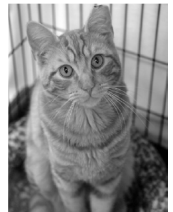
Is dinner ready?

Gerber 2nd Baby Food – Chicken, Turkey Royal Canin Babycat, Science Diet Kitten Royal Canin Special 33, Science Diet, Nutro, ProPlan brands dry foods Canned kitten/cat foods KMR (Kitten Milk Replacer) Postage stamps Drawstring Kitchen Bags Paper towels, bleach Hand sanitizer Costco gift card Pet Supply Store gift card