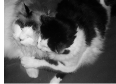
Sophia & Bocelli