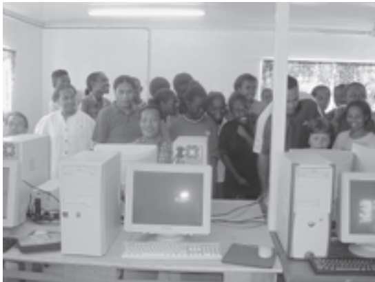
Staff and students at Atoifi Adventist Hospital are excited about being connected to the Internet.

This project was started last year, but it was delayed for unknown reasons. However, it recommenced earlier this year and the project to connect the hospital was completed in June.