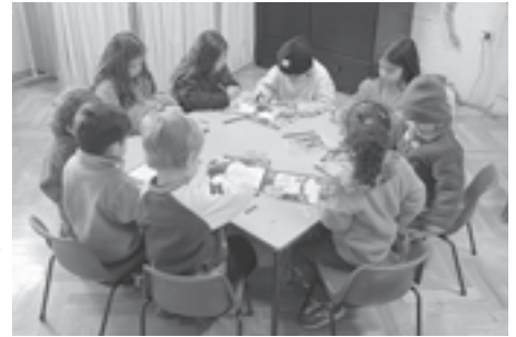
Children doing craft work at the holiday Bible school program run by the Wetherill Park church.

Running a holiday Bible school program will require a huge commitment on the part of the church, according to Mrs