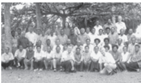
Principals from across Papua New Guinea attended the first conference for principals of Adventist schools.