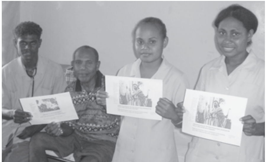
Nurses who work at the Atoifi Adventist Hospital in the Solomon Islands are reaching out to patients with the "Helping a friend to meet my friend Jesus" program.