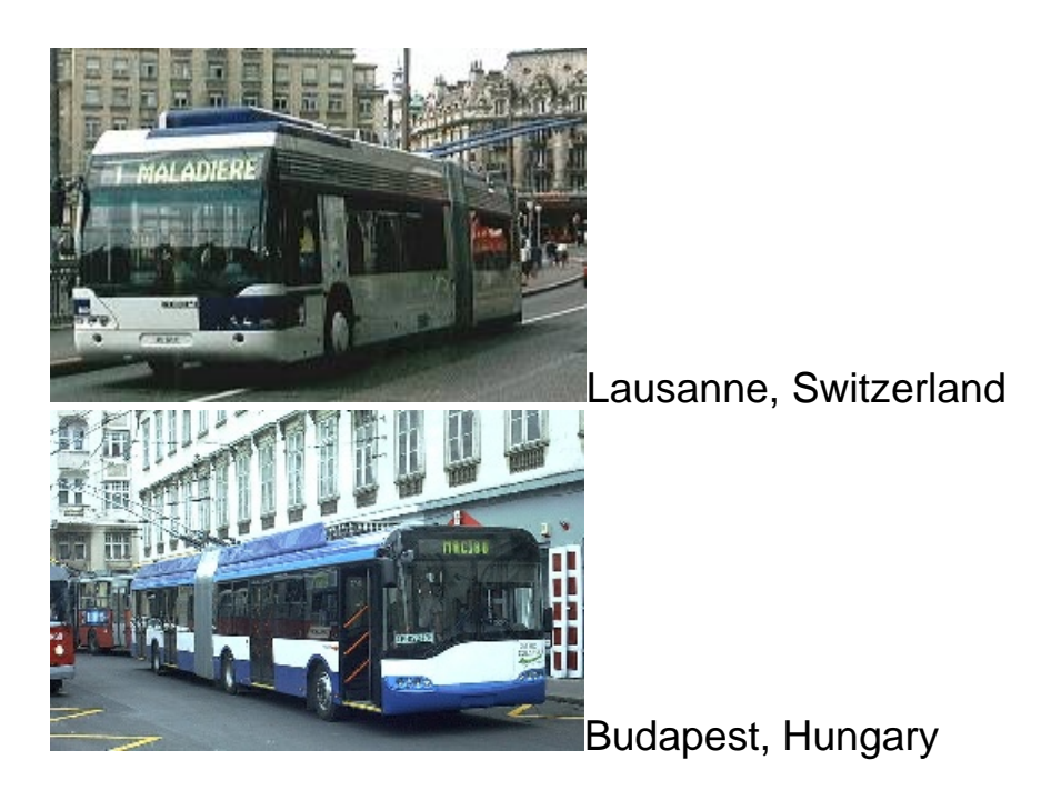
Figure 2- Trolleybuses in service. Notice how unintrusive the overhead wires are in an urban environment.

While this report strongly advocates the introduction of trolleybuses in Los Angeles, it is under no illusion that they will replace transit buses entirely. Clearly the economies of trolleybuses preclude their use in areas where bus frequencies and ridership are low.