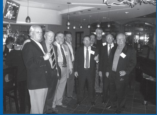
Above: Members from Class of 1956 (left) & 1966 (right)