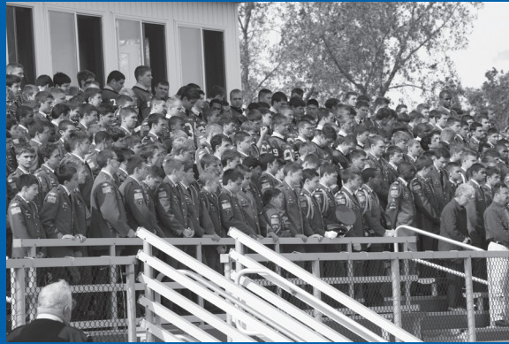
Below: LSI Student Body at Pep Rally and Dedication Ceremony honoring St. John Baptist de La Salle