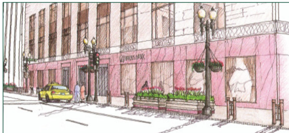
Artist's rendering of the new look that the outside of The CBOT Building will be getting in the Spring of 2007 to showcase the beauty of the Art Deco façade.

In its ongoing enhancement program, the C-B-T Corporation recently engaged Fujikawa Johnson Gobel Architects for a new site improvement project on the outside of the Landmark CBOT Building. This outside renovation includes repairs and an upgrade to the sidewalk areas on Jackson Boulevard, Financial and Van Buren Streets, as well as the LaSalle Street Plaza.