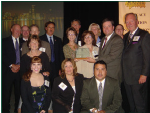
The C-B-T Corporation and The Chicago Board of Trade Building team.

In September, The CBOT Building team took home the prestigious 2006 TOBY (The Office Building of the Year) Award in the Renovated Building category. Presented at the annual BOMA/Chicago (Building Owners and Managers Association of Chicago) awards event, TOBY recognizes excellence in commercial property management and salutes superior performance in building operations.