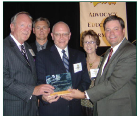
C-B-T Corporation and The Chicago Board of Trade Building team took home the prestigious 2006 TOBY Award for Renovated Building.

Now in its 22nd year, the TOBY Award is the most renowned and comprehensive program of its kind in the commercial real estate industry. Participants are judged on the effectiveness of their overall management in 11 categories, including community impact, tenant relations, energy management, emergency preparedness and training for personnel. Detailed property