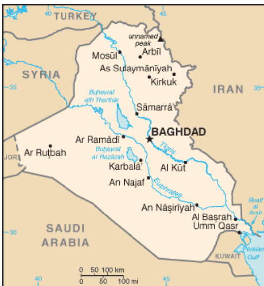
CIA World Factbook 2002