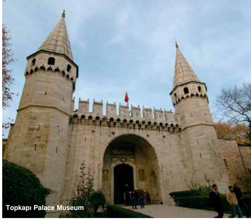
Topkapı Palace Museum

Ekinciler Caddesi No: 4 34810 Kavacık, Beykoz