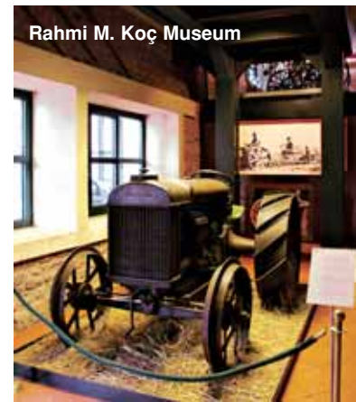
Rahmi M. Koç Museum

legraph, Telephone) is located in the Grand Post Office building in Sirkeci. The objects displayed in the museum include a copy of the original telephone made by Alexander Graham Bell and given to PTT in 1882 as a present. The museum is closed at the weekend.