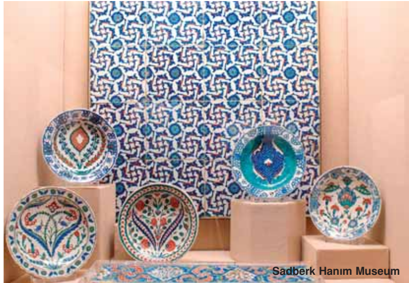
Sadberk Hanım Museum

İstanbul stands out among Turkey's unique national industrial heritage. The museum contributes to İstanbul to take a more effective place in the arts and culture networks worldwide.