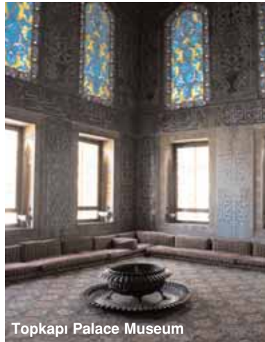
Topkapı Palace Museum