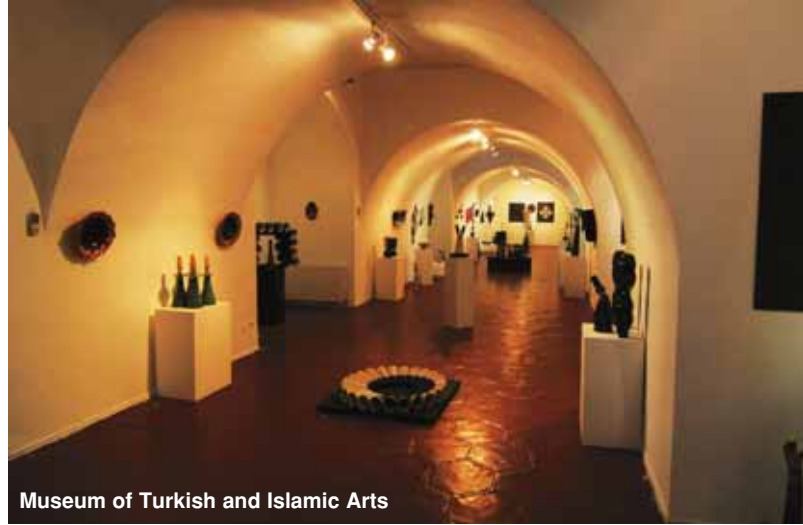
Museum of Turkish and Islamic Arts

The museum is located in two buildings next to the ferry landing. One of them is the Caiques Gallery