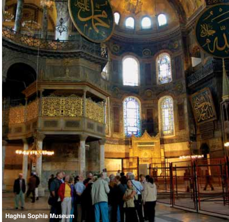
Haghia Sophia Museum

Meclis-i Mebusan Caddesi Liman İşletmeleri Sahası, Antrepo No: 4 Karaköy