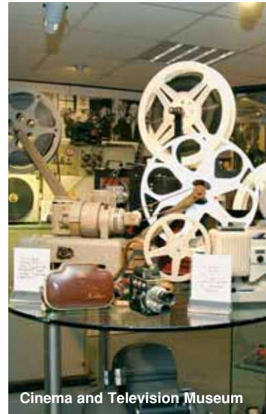
Cinema and Television Museum

İstiklal Cad. No: 285 Beyoğlu Phone: (+90 212) 252 47 00