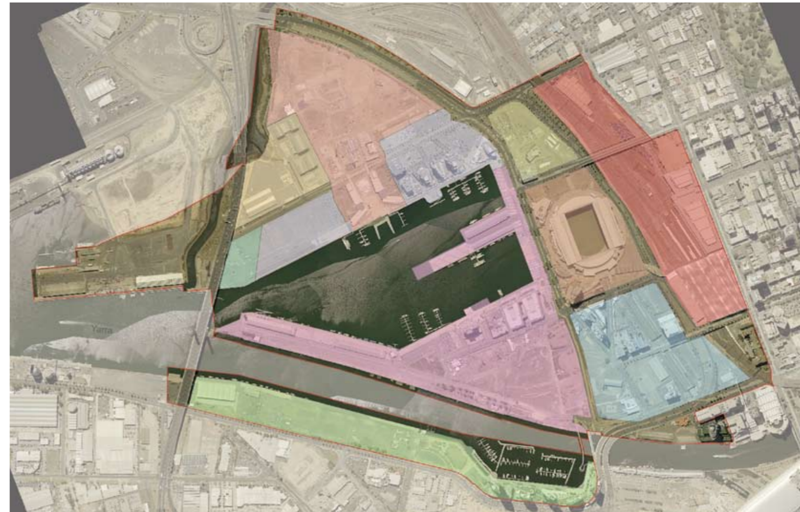
Docklands and its precincts

The Docklands area is 3.003km 2 , making it larger than Melbourne's central business district and six times the size of Sydney's Circular Quay. Docklands is bordered by Spencer Street to the east, the Bolte Bridge to the west, Footscray Road to the north and Lorimer Street to the south.