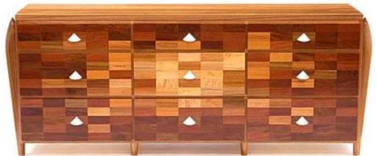
Autumn Abstract 2000