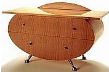
George Jetson 1999