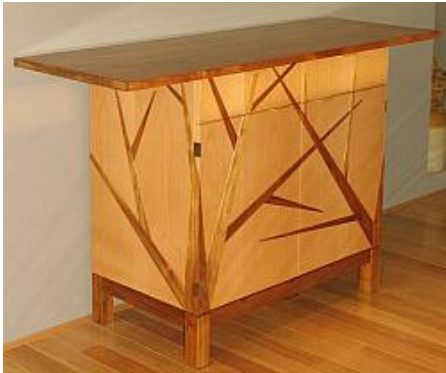
Silhouette Cabinet 2005