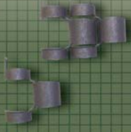
M13 Link — 7.62mm