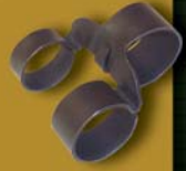
M9 Link — .50 Caliber