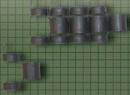
M27 Link — 5.56mm