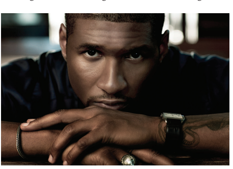
Usher claims the Hot Shot Debut on the Hot 100 and bows at No. 4 on Top Albums.